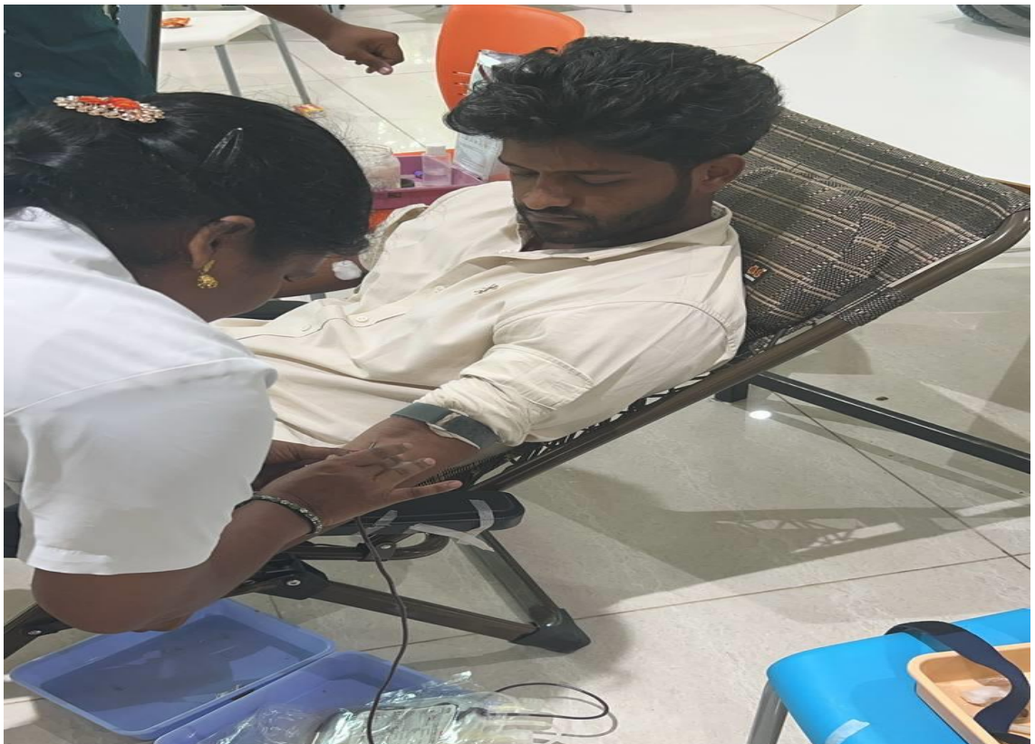
Blood donation camp on 29-09-2023