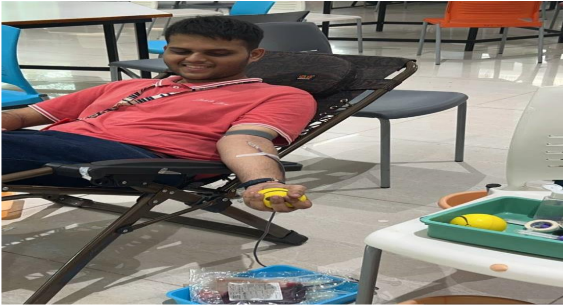
Blood donation camp on 29-09-2023