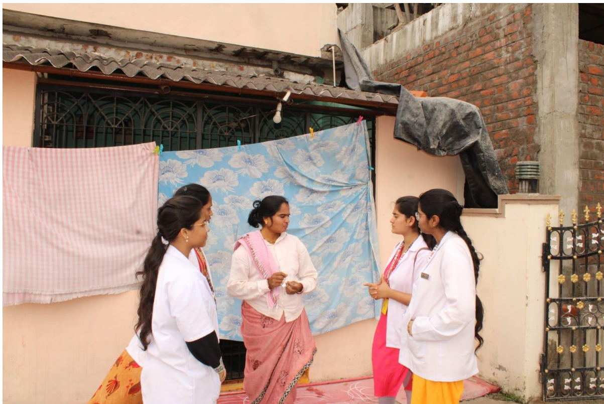
Students are giving awareness on immunization to the village people on 08-09-2023