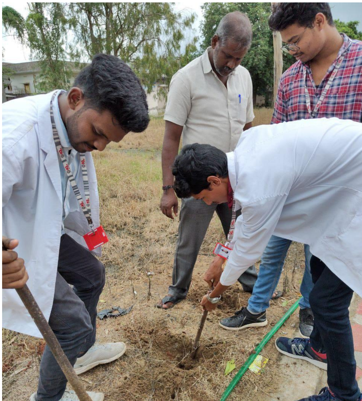
PLANTATION BY STUDENTS ON 09-01-2024 AT GUNDIMEDA VILLAGE