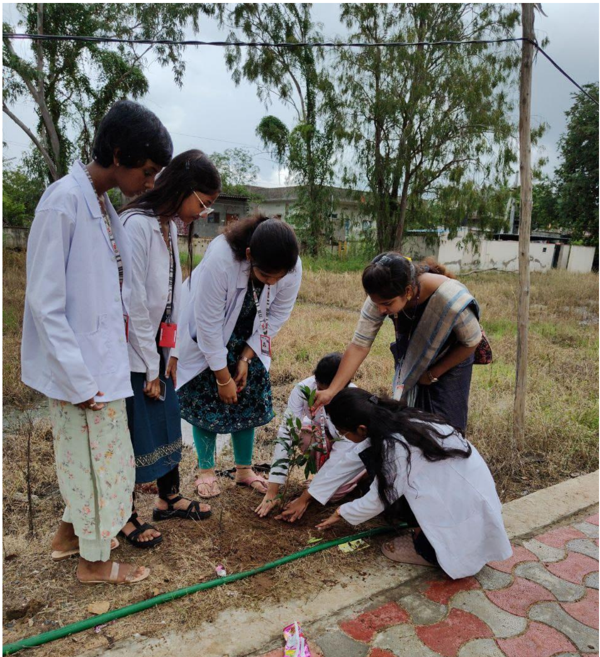
PLANTATION BY STUDENTS ON 09-01-2024 AT GUNDIMEDA VILLAGE