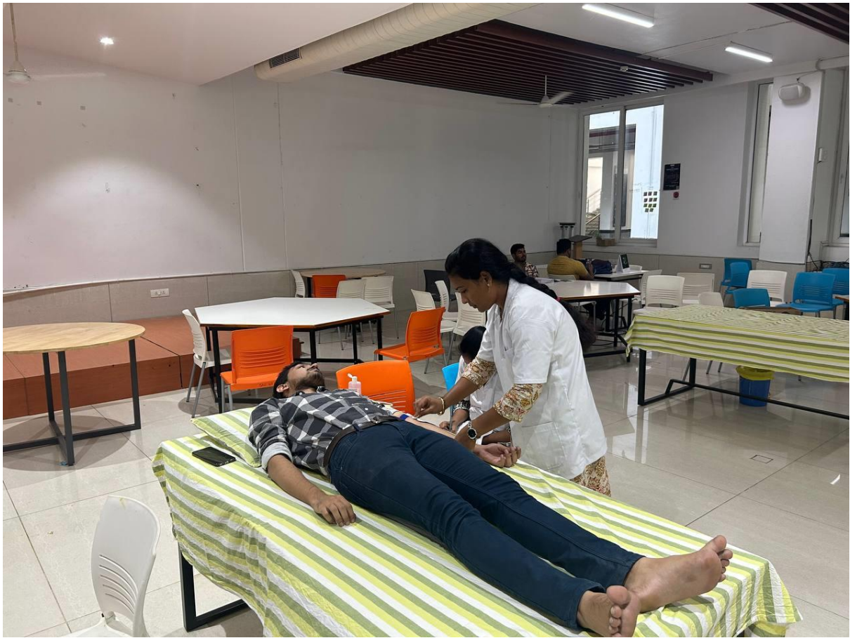
Blood donation camp on 18-08-2023