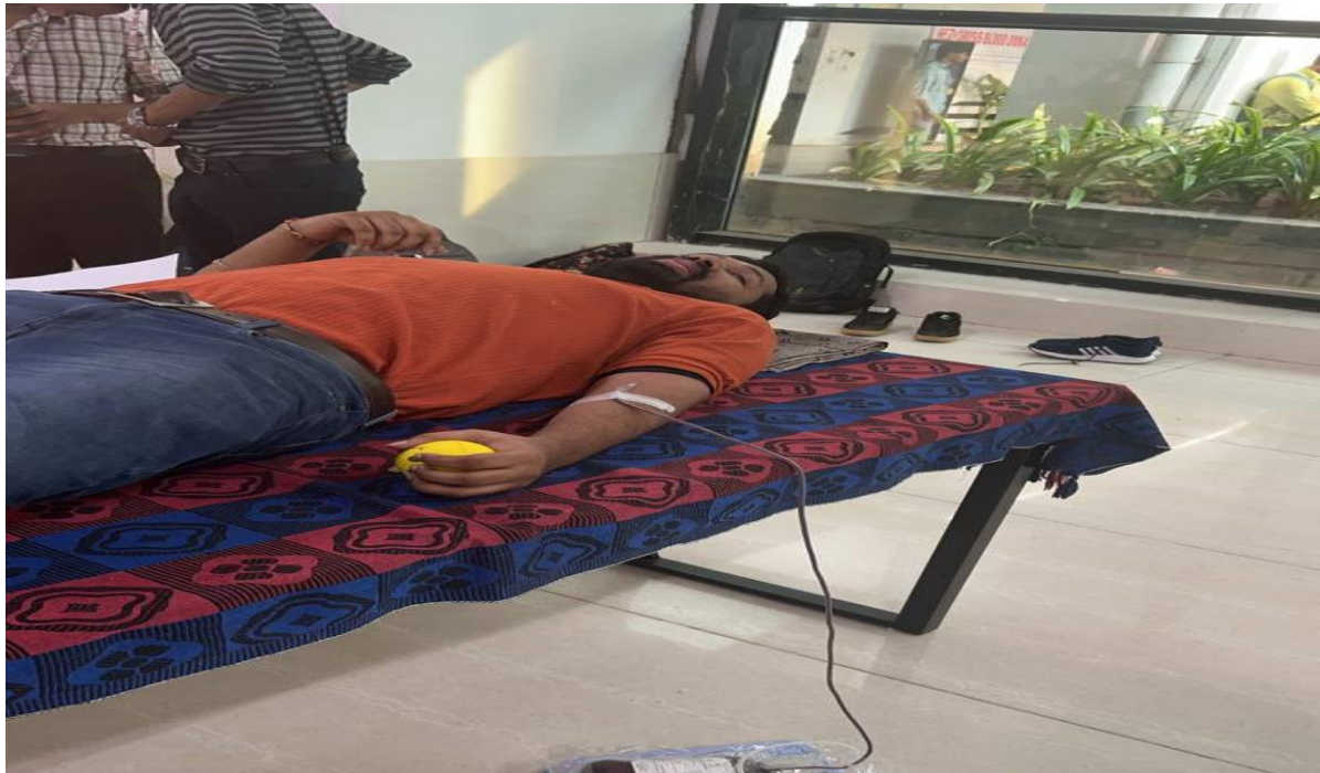
Blood donation camp on 18-08-2023