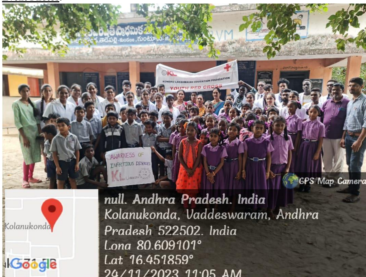
KL College of Pharmacy Faculty and students along with Zilla Parishad students and staff.