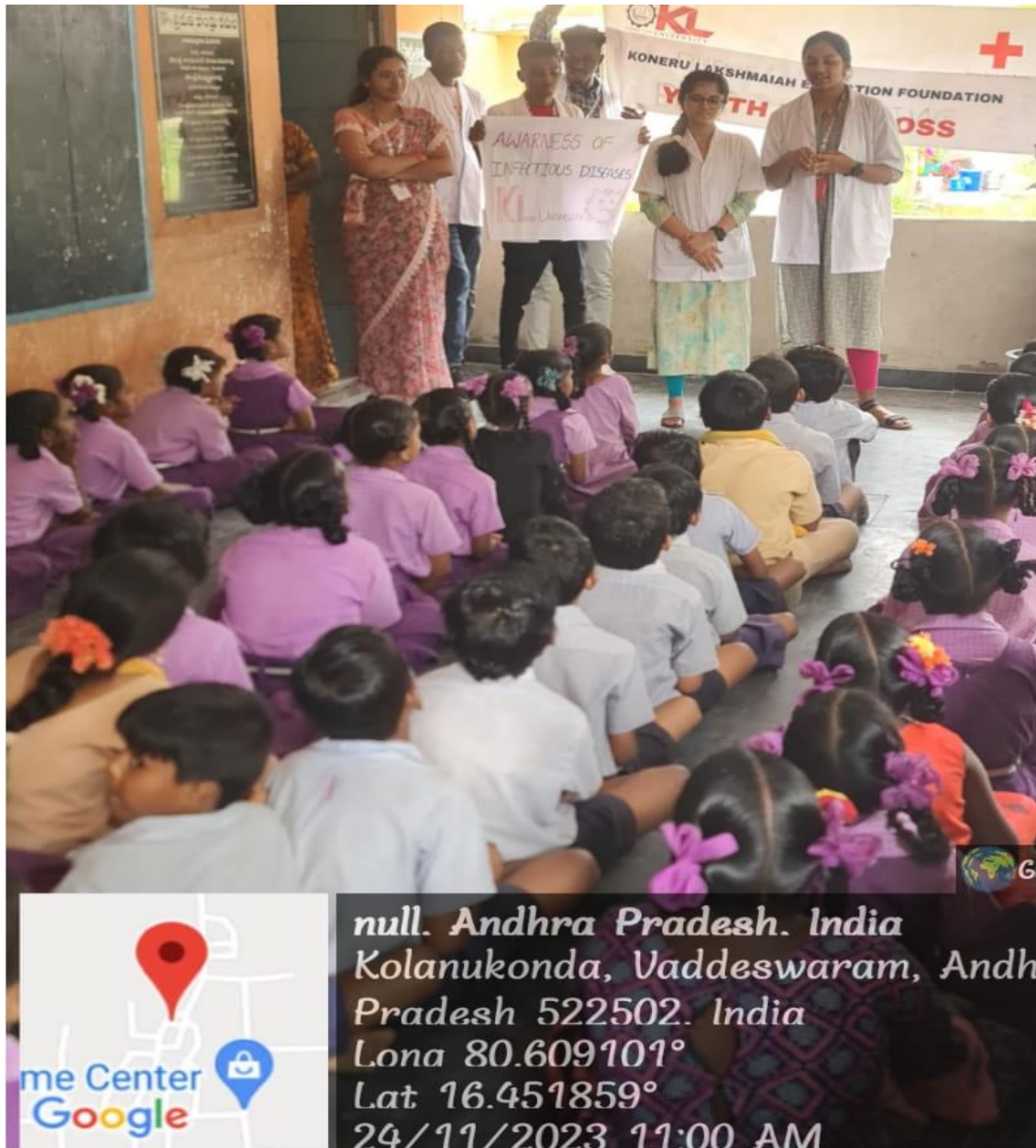
B Pharmacy first year students explaining about immunizations, immunity, and infectious diseases.