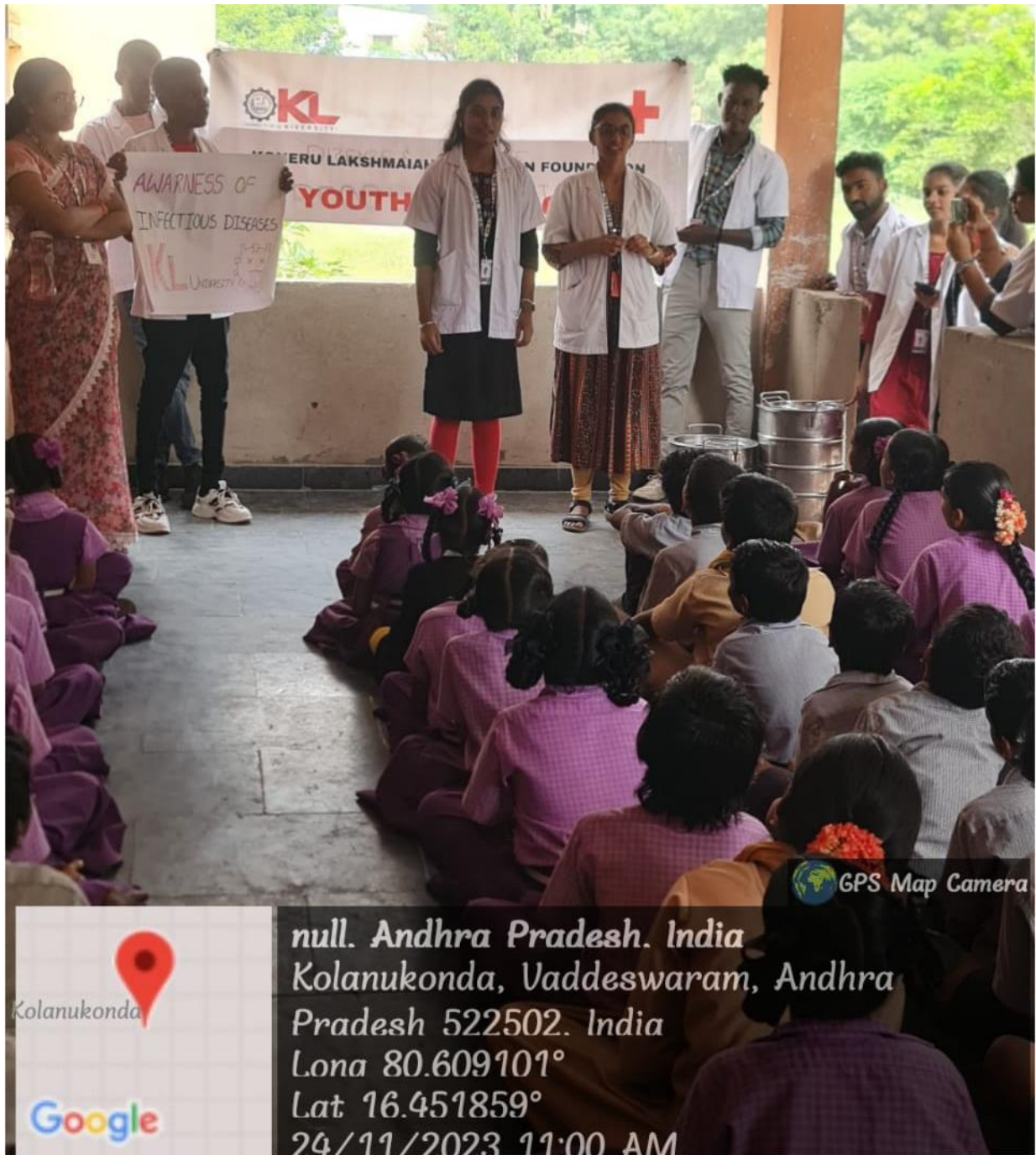
B Pharmacy first year students explaining about immunizations, immunity, and infectious diseases.