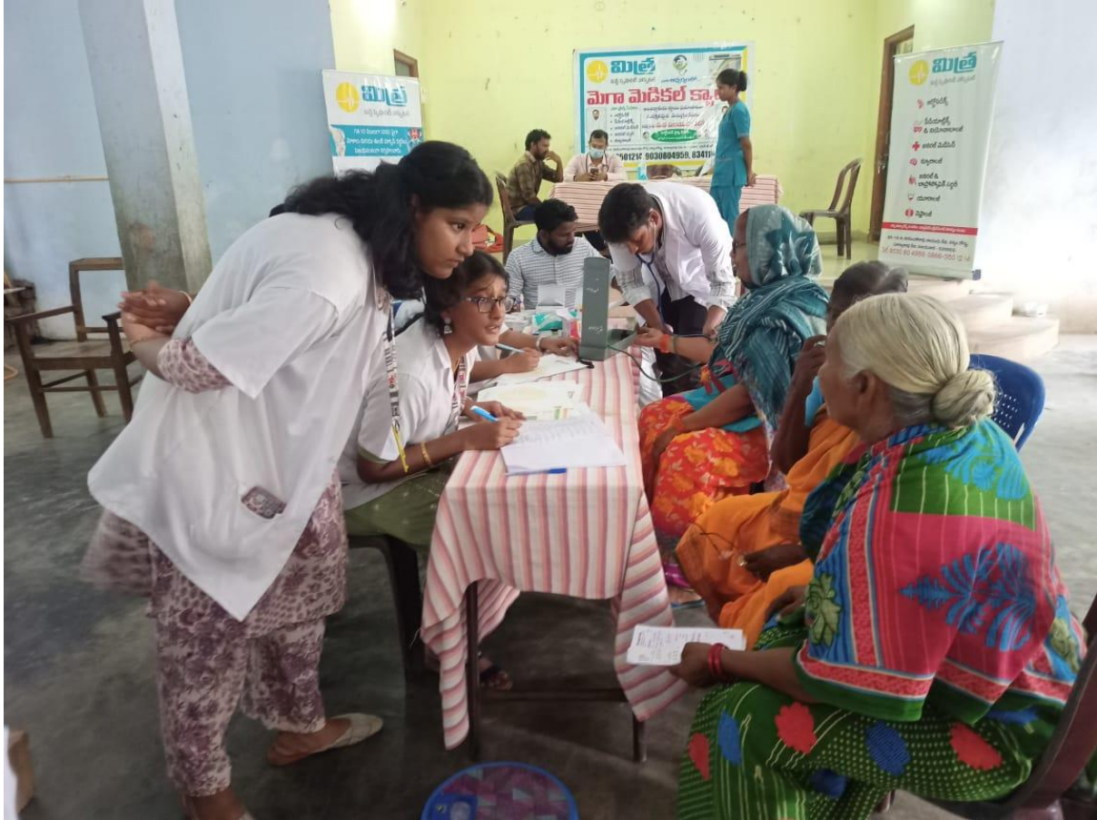
Eye check-up camp conducted on 14-08-2023

We extend our heartfelt gratitude to everyone who participated, contributed, and supported this vital cause. Together, we are making a tangible difference in our community.