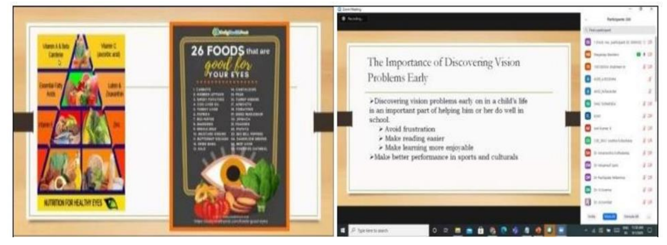
Slides of Webinar on Children's eye health and safety by Team YRC KLEF on 1st Sep 2020

Poster of Webinar on Children's eye health and safety by Team YRC KLEF on 1st Sep 2020