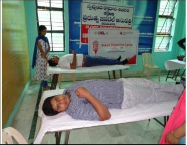
Blood donation camp- with donors and dignitaries of the event