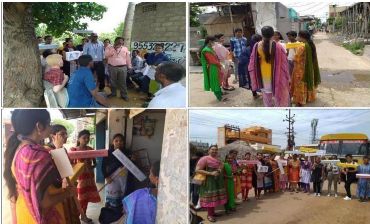
Awareness about seasonal diseases by Team YRC KLEF in Atmakur village on 14 th September 2019