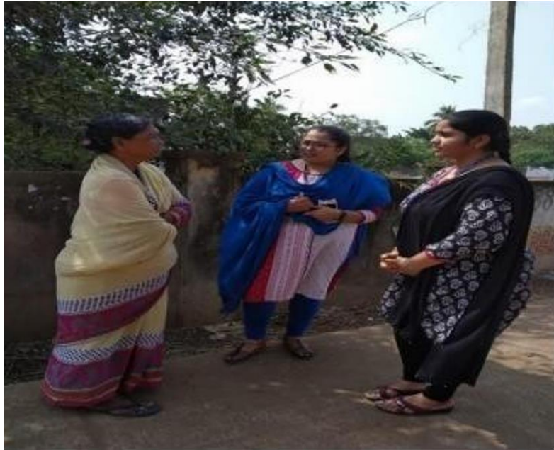
Health awareness program at Pedapalem Village on 31 st January 2020 by Team YRC KLEF