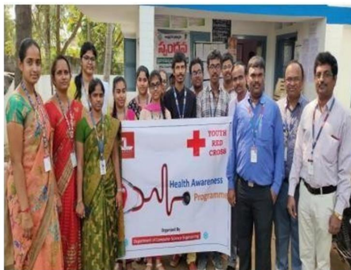
Health awareness program at Pedapalem Village on 31 st January 2020 by Team YRC KLEF