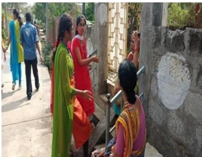
Health awareness program at Pedapalem Village on 31 st January 2020 by Team YRC KLEF