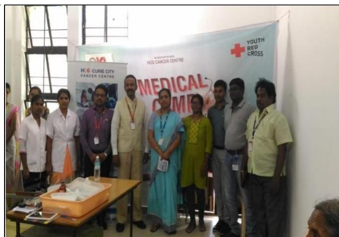
Notable dignitaries at medical camp