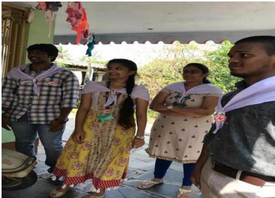
Health awareness camp by Team YRC KLEF at Pedapalem village on 06 th October 2018