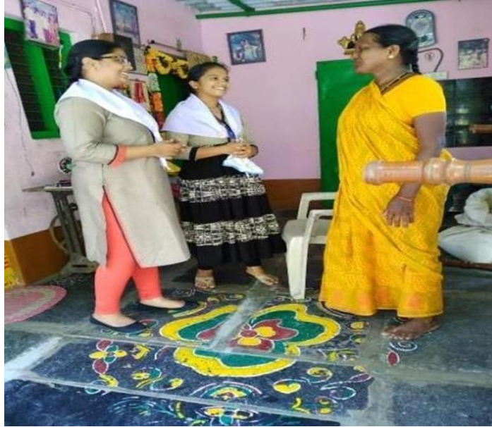
Health awareness camp by Team YRC KLEF at Pedapalem village on 06 th October 2018