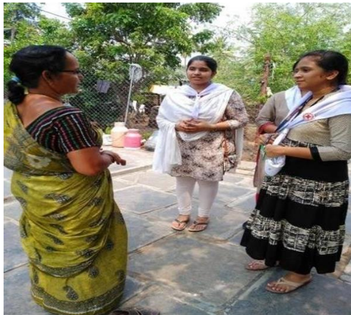
Health awareness camp by Team YRC KLEF at Pedapalem village on 06 th October 2018