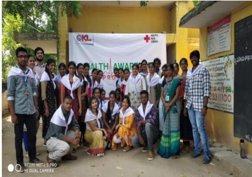
Health awareness camp by Team YRC KLEF at Pedapalem village on 06 th October 2018