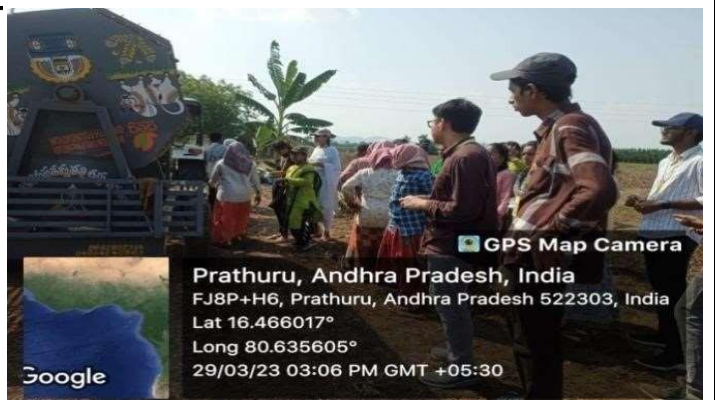
A group of students is engaged in a meaningful inter action with a group of local farmers on 29/03/23