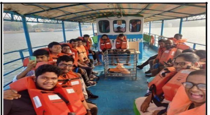
Students of 20 schools of Vijayawada city participated in the 3K EcoWalk organized at Amphitheater on Bhavani Island on 26/01/23