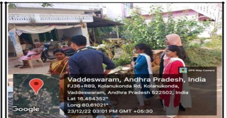
Students house-to-house awareness survey in village to identify the students who had stopped their studies mid-way as school drop outs on 23/12/22