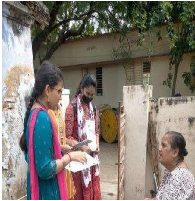
Students conducting house hold Survey in villages on 05/11/22