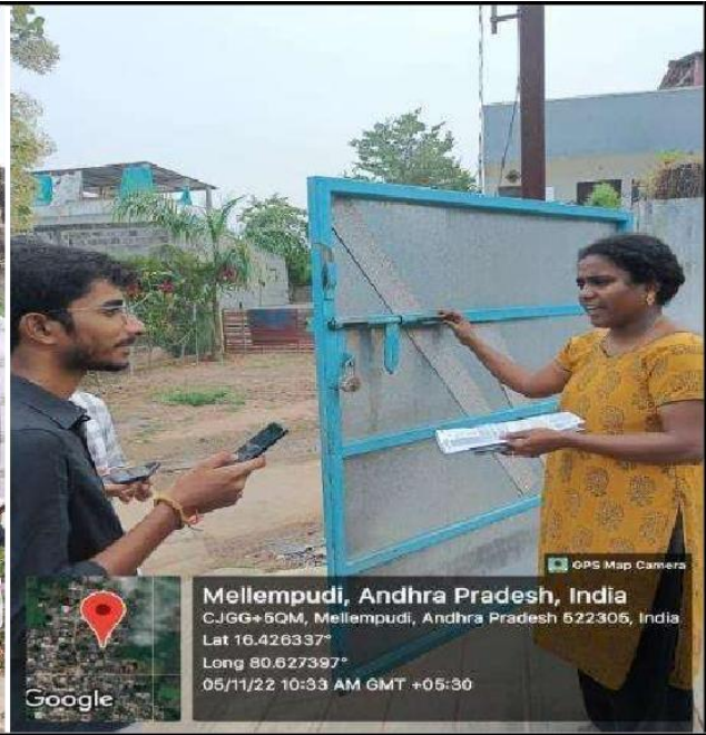
Students conducting house hold Survey in Mellempudi village on 05/11/22