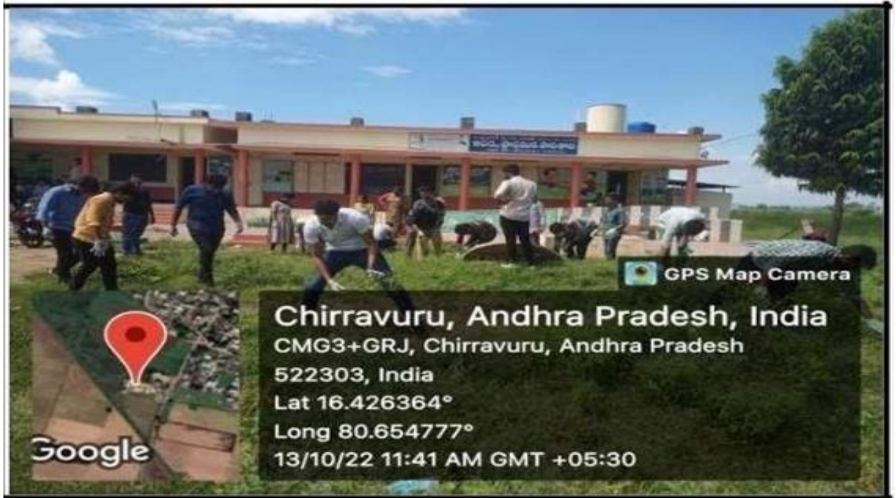
Students participating in Swachh Bharat At ZPHS school chirravuru village on 13/10/22