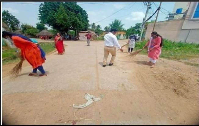
NSS Students cleaning atmakuru village roads as a part of Swachh Bharath and organised rally on 16.09.21