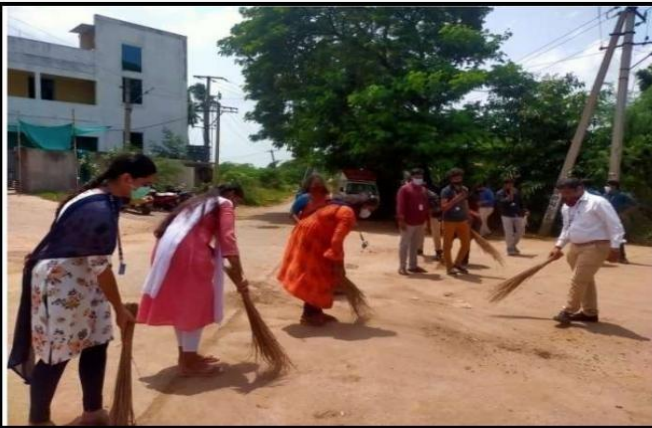
NSS Students cleaning atmakuru village roads as a part of Swachh Bharath on 16.09.21