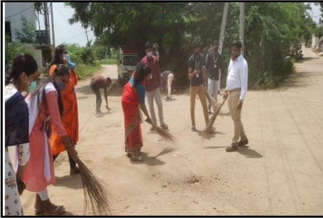
NSS Students cleaning atmakuru village roads as a part of Swachh Bharath on 16.09.21