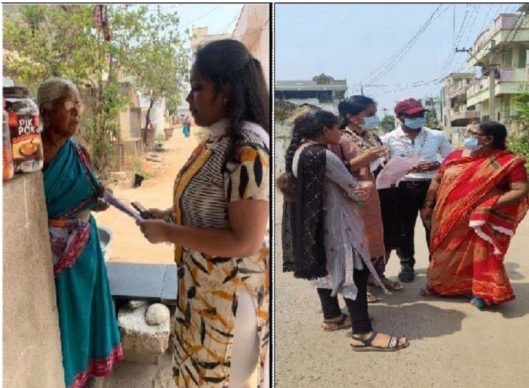
Volunteers conveying important information regarding E-Shram Portal using mobile to the public at vaddeswaram on 30/04/22