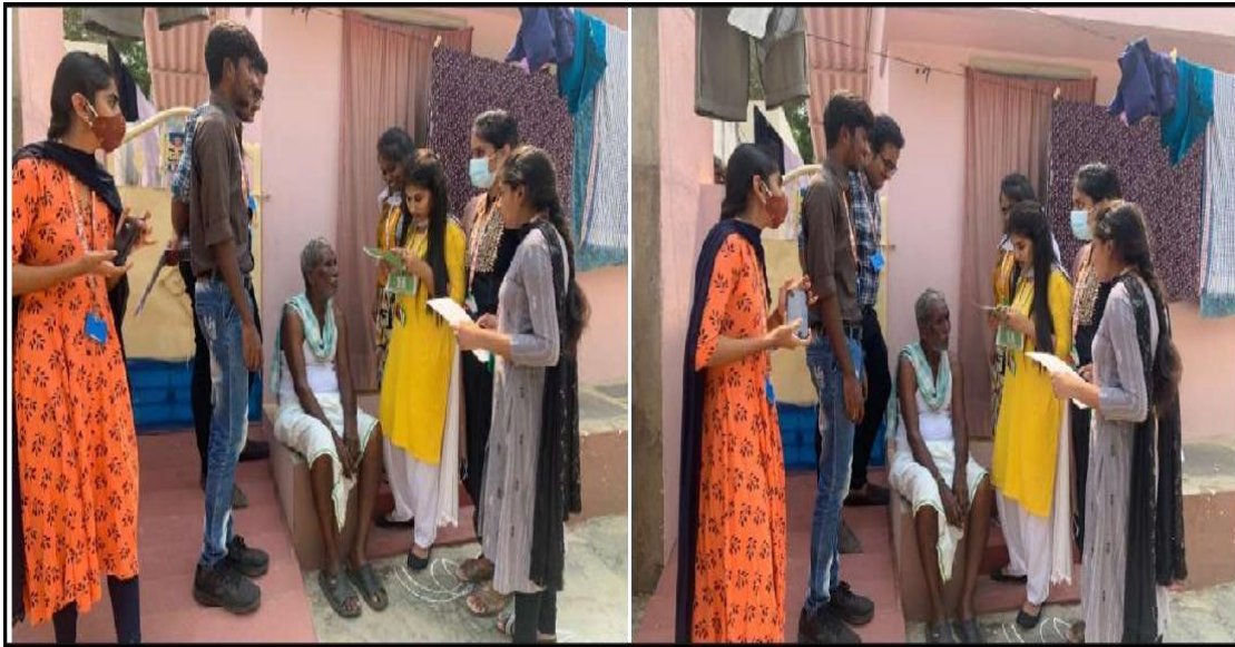
students creating awareness with posters on e-shram scheme at vaddeswaram on 30/04/2022