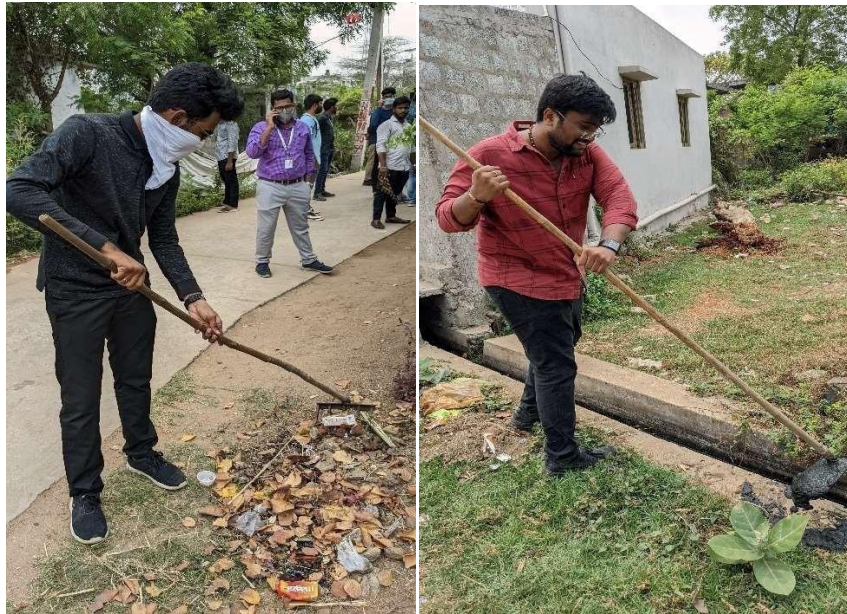
Students are Cleaning Roads and Dust in the Village