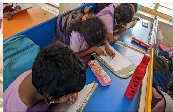
Students conducting games to school children