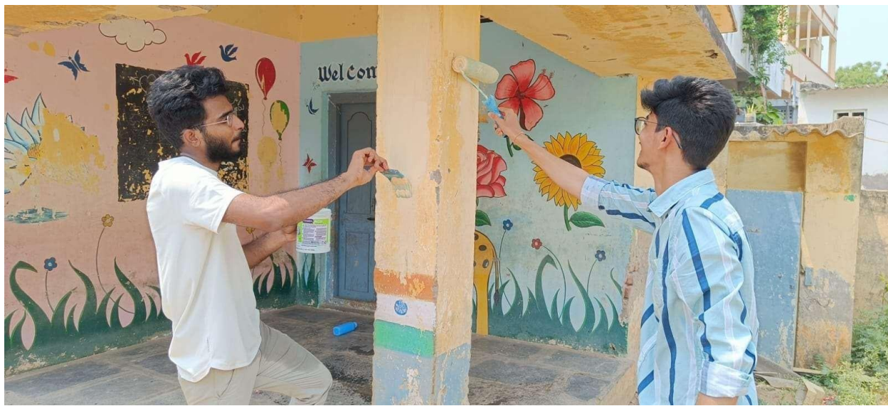
Students are painting the anganwadi school at kolanukonda