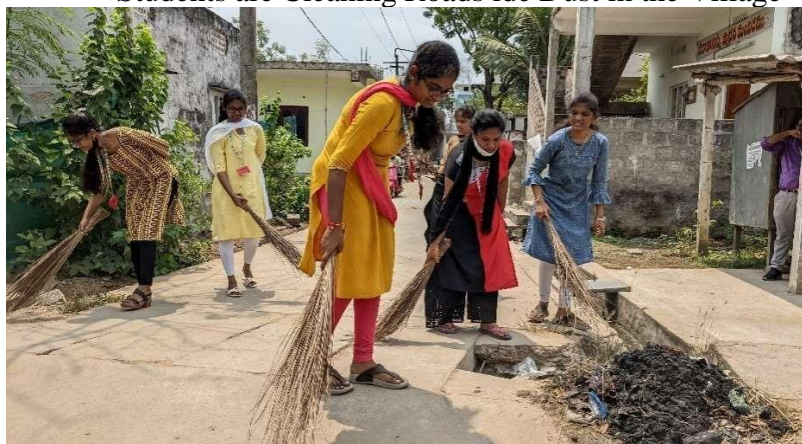
Students performing cleaning of roads in Kolanukonda