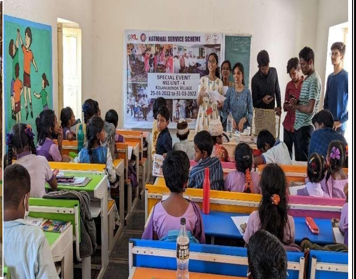
Students are explaining about rules of the games to the school students