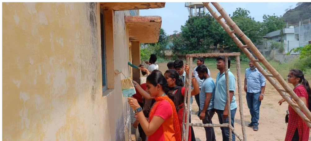
Students painting the anganwadi school at kolanukonda