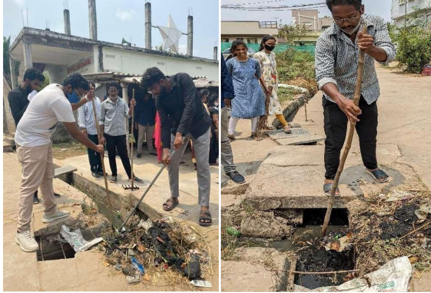
Students are cleaning drainage in the village on 25/03/22