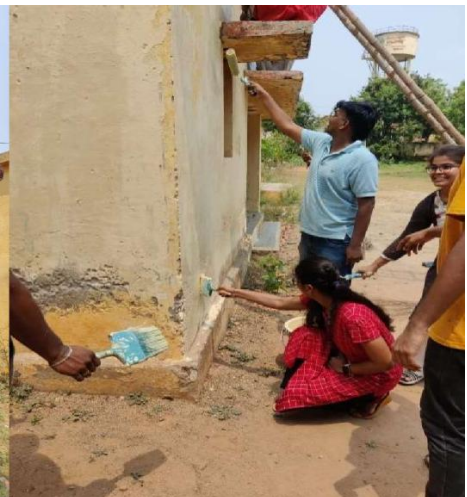
Students painting the anganwadi school at kolanukonda