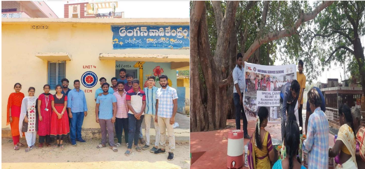
KL university Students painted aganvadi school