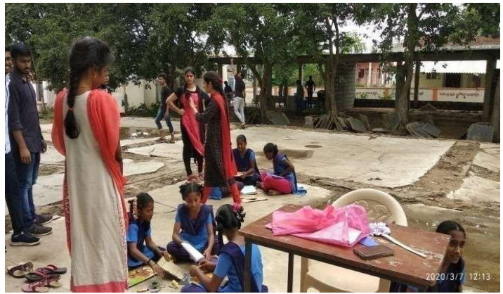
NSS students conducted crafting competition to the school students.