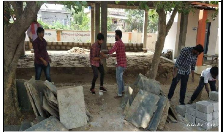
Students are mixing cement and sand for constructing purpose.