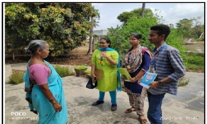
Students are giving awareness on health and hygiene to the villagers On 06/03/22