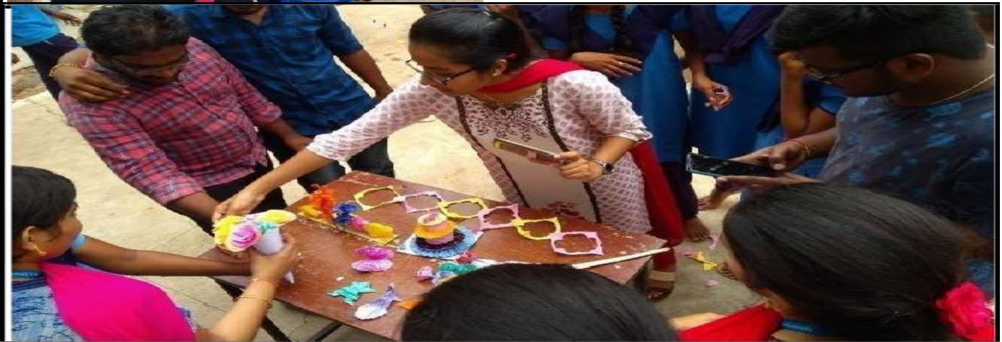
Students are actively participated in the crafting competition.