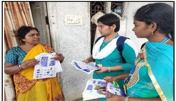
Students are giving awareness on immunization to the villagers.