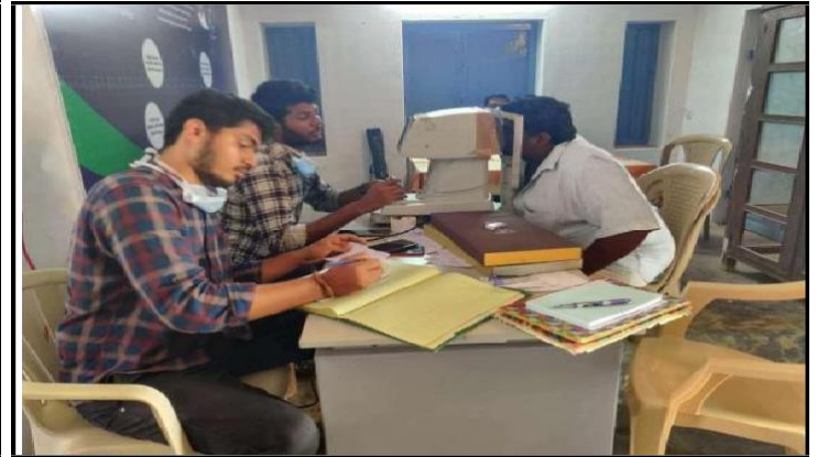
conducted medical camp in village