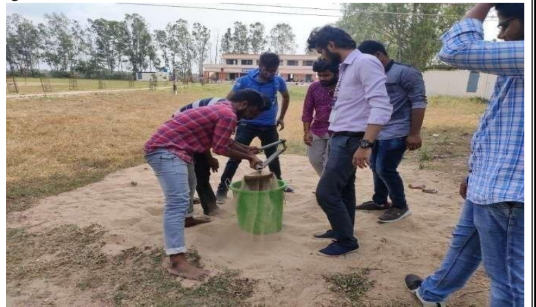
Students mix up sand and cement them in a correct ratio for the wall.