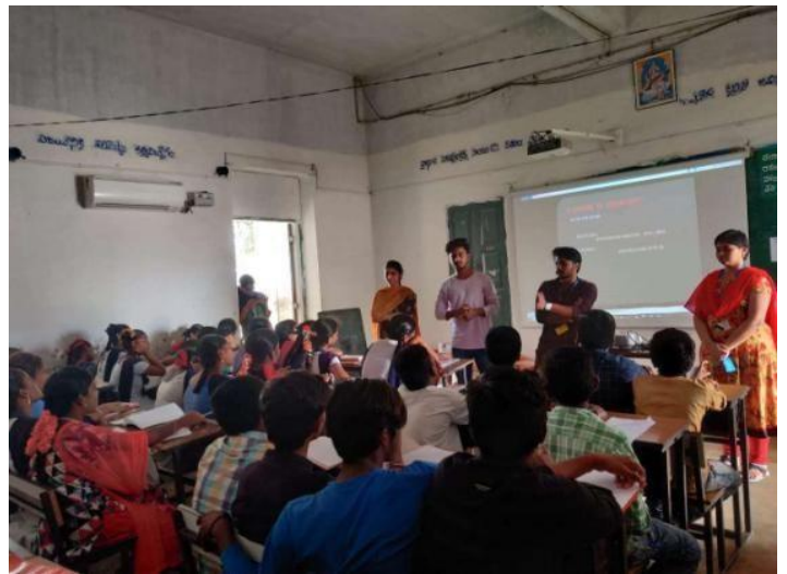
Students are teaching career guidelines to the school students.

If they have a pre-planned guidance for your career then it can make a lot of difference. Today, awareness about career guidance is still very low among the younger generation. The culture of going to a counselor is so important in our country. So we decided to give the right guidance to the upcoming citizen