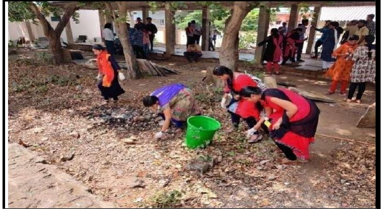
Students are cleaning the roads in the streets and removing the waste from the road on 06-03-22