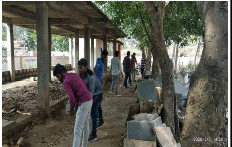
Students are covering floor with mud for the construction