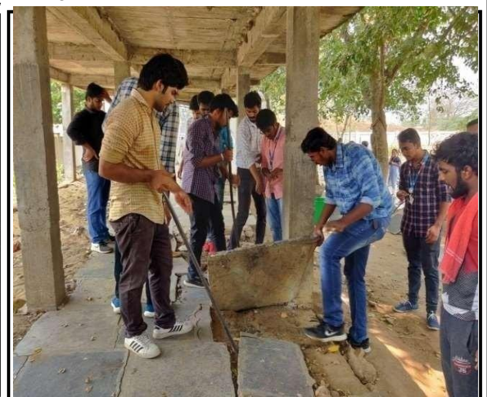
Students are preparing the flooring for class rooms