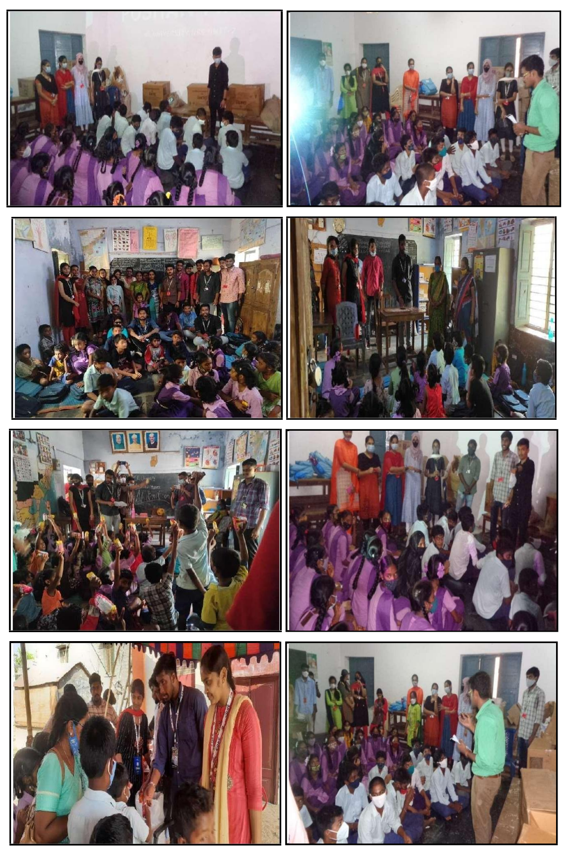
Creating conducting Orientation to Students&Playing Games