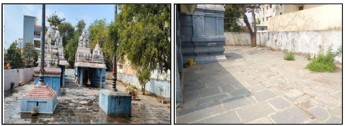
After the cleaning the temple and removing waste pants and dust