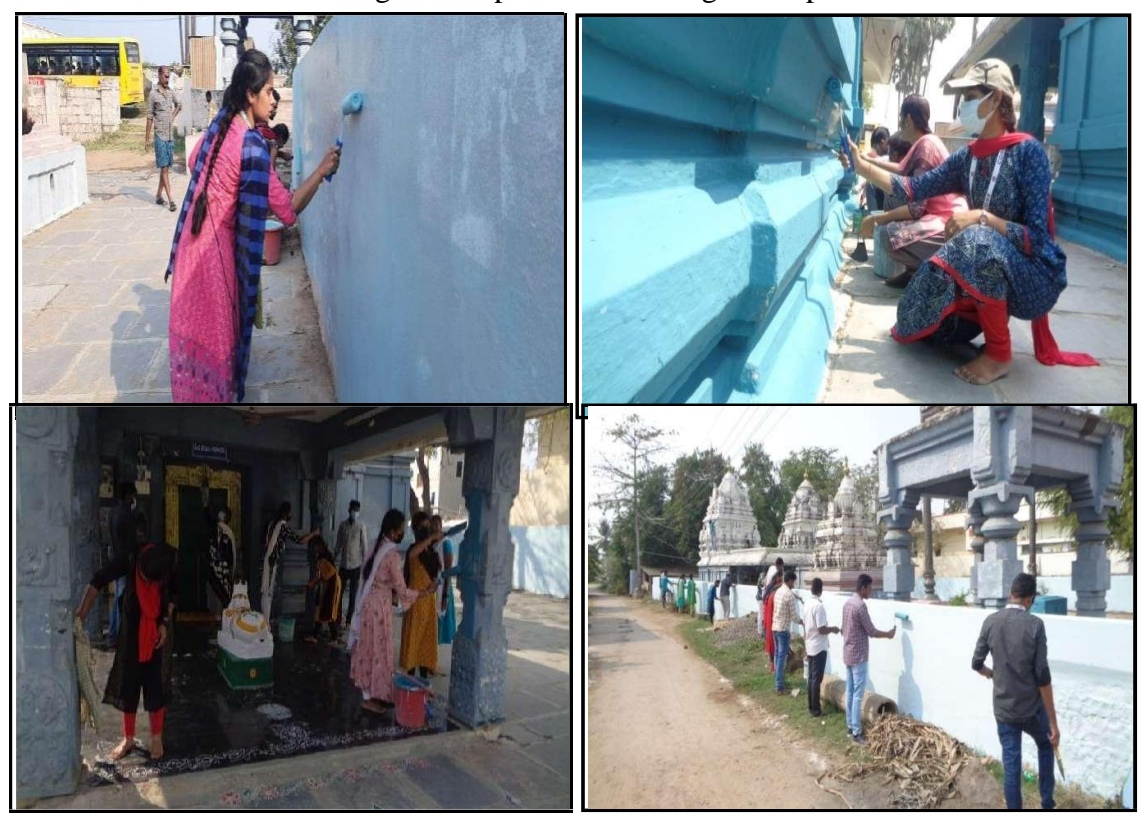
Students are painting the temple around the wall and inside the temple