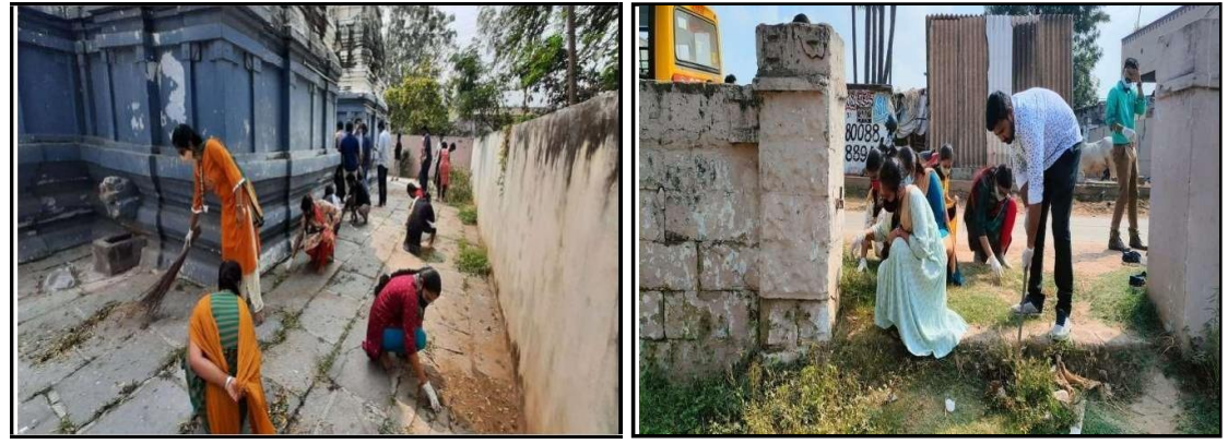
Students are removing waste around the temple