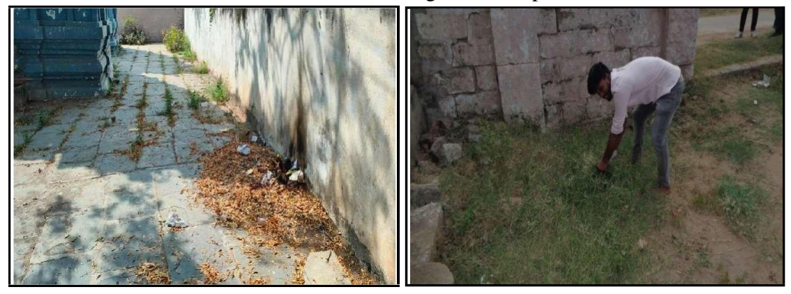
Students started cleaning the temple