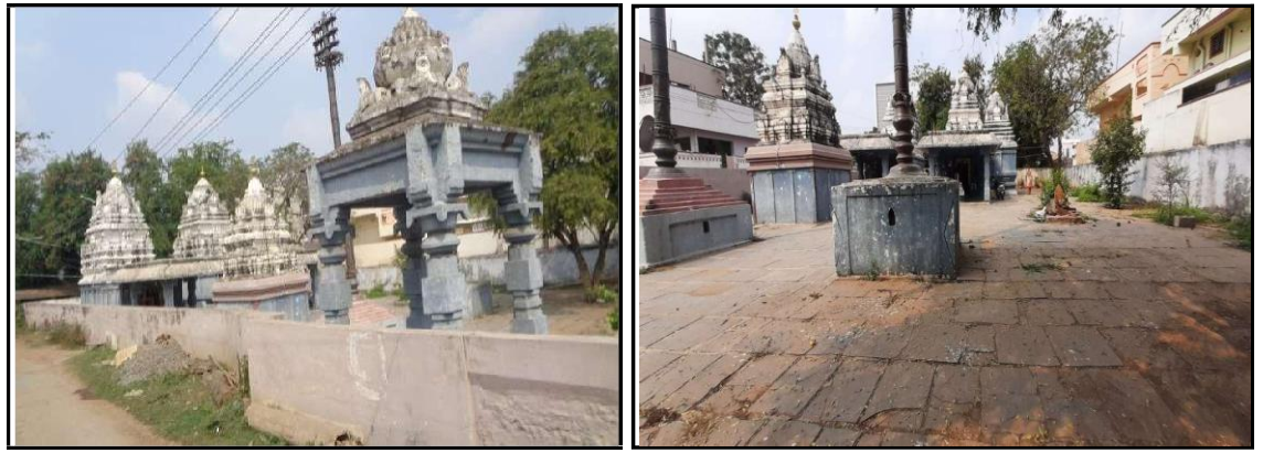
Before the remodeling of the temple