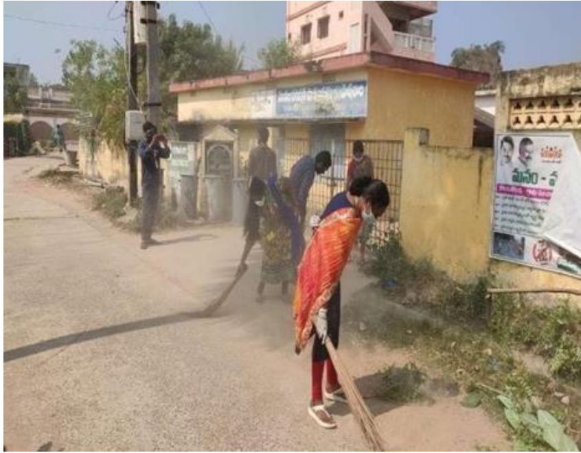
Students cleaning the roads near ZPHS school in Kolanukonda village under Swachh Bharath on 15/08/21