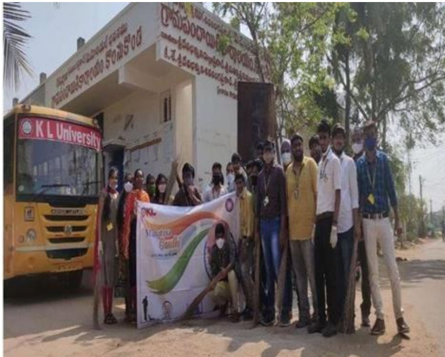
A group of volunteers cleaning streets participating in the Swachh Bharat (Clean India) initiative at Kolanukonda on 15/08/21