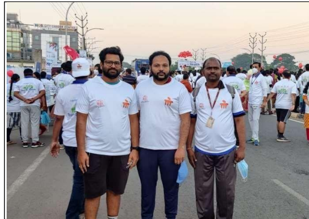
students is seen participating in the Run for Health program on 05/12/21