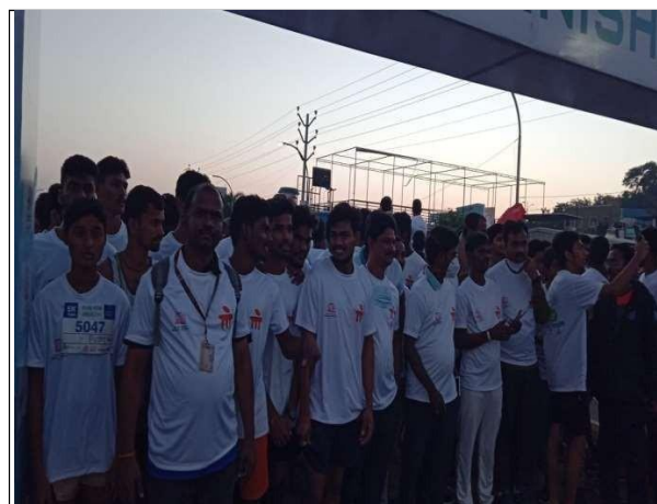
Volunteers and Local youth participated in run for health program at Vijayawada on 05/12/21