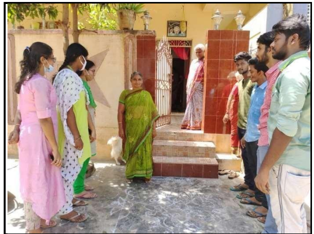
Students are raising awareness about the importance of cleanliness and maintaining clean surroundings at kolanukonda village on 02/10/21