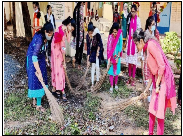
Students are engaged in planting trees and clearing dust from the vicinity of the school premises