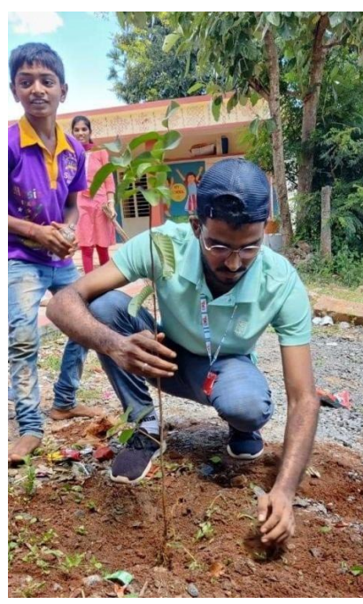
Students clean the school premises, dug pits for planting saplings, and diligently watered them to ensure their growth at kolanukonda village on 02/10/21.