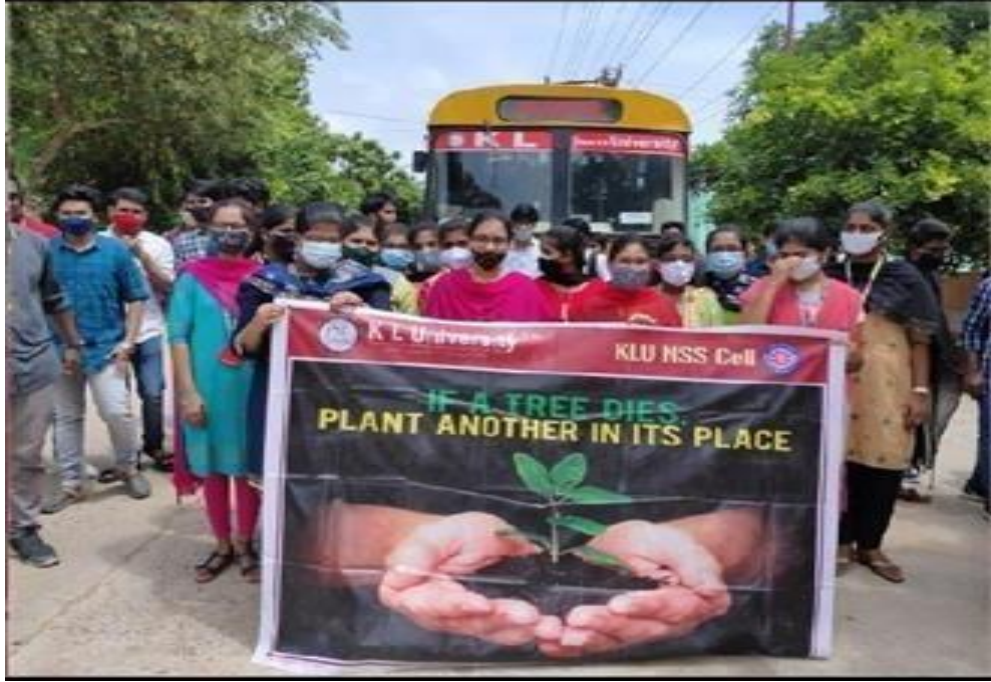
NSS Volunteers in plantation program at vaddeswaram villagers on 15/08/21