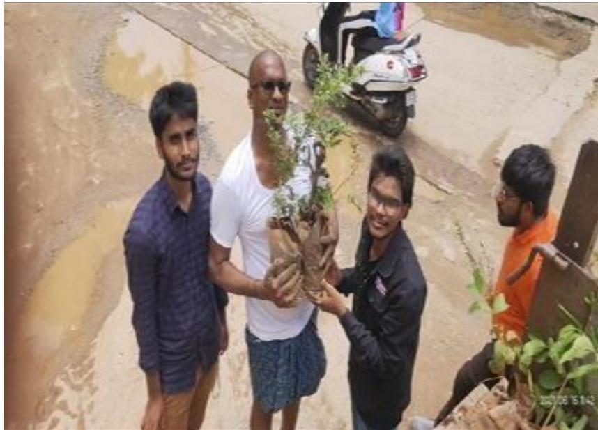
NSS students distributed plants to every house in vaddeswaram village on 15/08/21