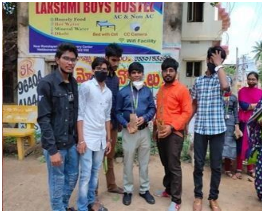
NSS students distributed plants door to door in vaddeswaram village on 15/08/21