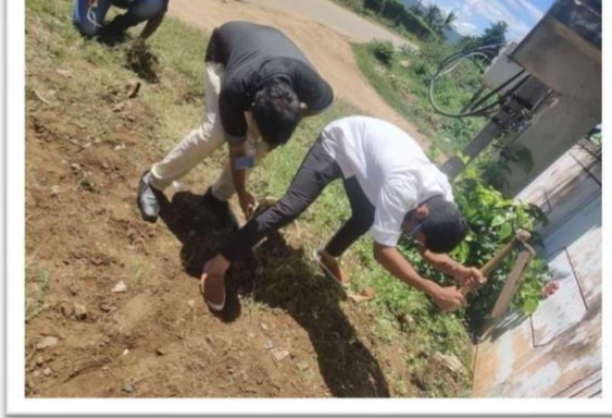
Students working in village beautification program on 02/10/21