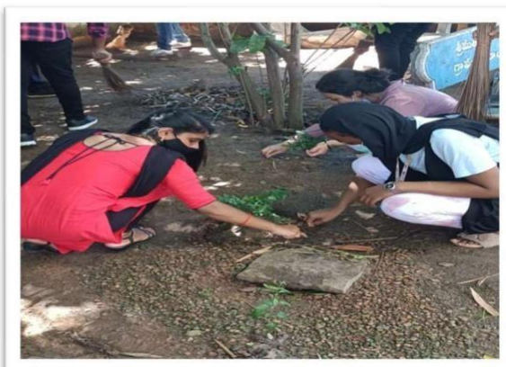
Students are cleaning the roads in the village as part of village beautification on 02/10/21