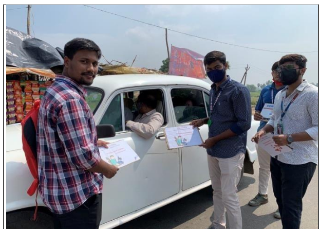
Volunteers giving Traffic and Road Safety awareness to villagers