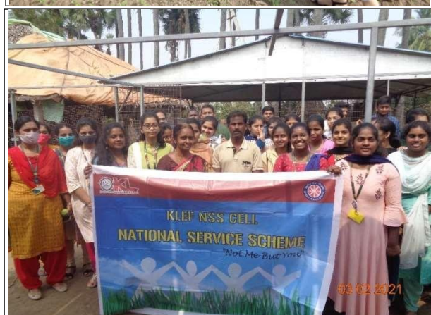
OrganicFarmerexplains theOrganic Farming methodstoNSSVolunteers atNutakki