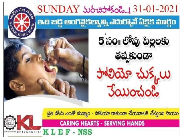
NSS Students educating the villagers about polio drops usage adopted by Govt. of India