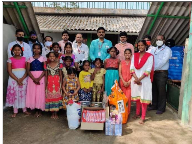
Groceries Donated to orphanage home at Kolanukonda