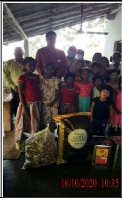
Groceries Donation to Yuvatharam Orphanage Home at Kolanukonda