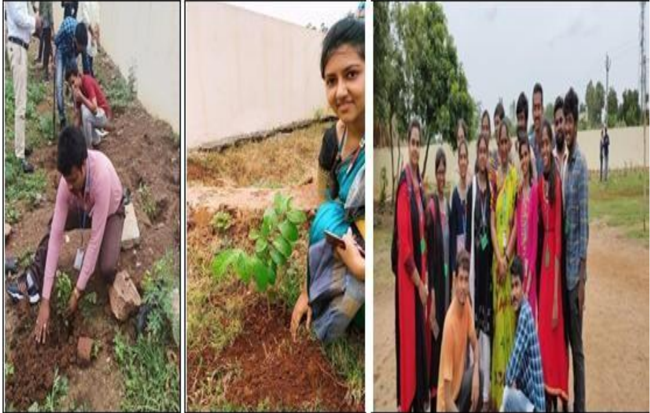
NSS Volunteers and Faculty sapling the plants

Date of Event : 20-08-2019 Name of the Event : Plantation Venue : Kaza No. of Participants : Students: 100 Staff: 02