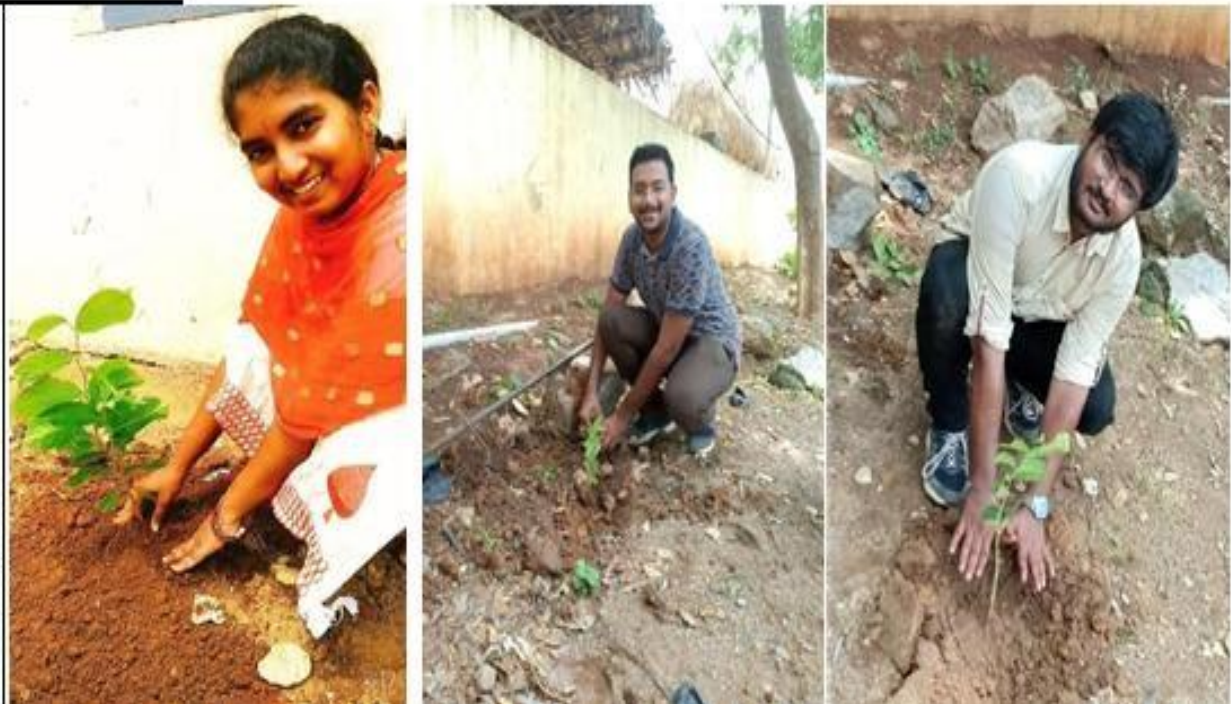
Students Involving actively in plantation