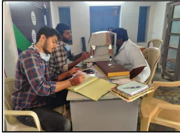
KLEF NSS Conducted Free Health Camp Villagers Utilize the camp