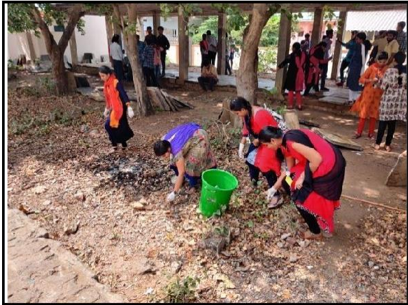
NSS Volunteers Clean the ZP High School Premises