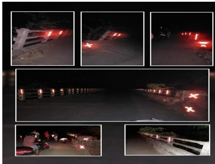
Volunteers Stitching the Radium stickers on Road and Bridge

Some Volunteer and NSS PO stayed during the night time and pasted some radium hoarding for the safety of the villagers during the road traveling at the night.