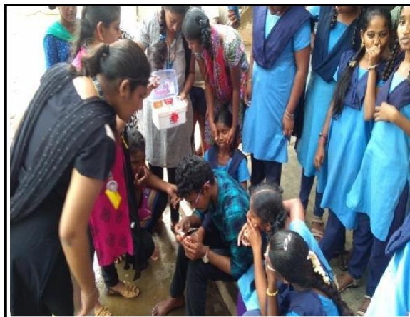
Awareness on First Aid Training to ZP High School Students