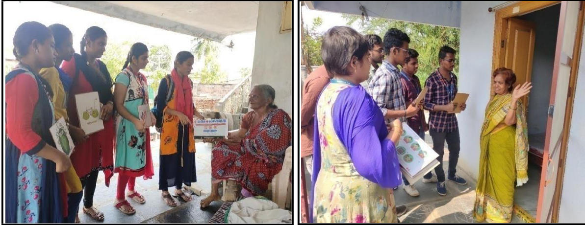
Awareness Campaign on COVID-19 to Pedapalem Villagers

At present the most dangerous news is all about corona virus, so we planned to give awareness regarding corona virus to the villagers so that they will not get afraid about it. The aim of this is to provide the base knowledge regarding corona virus so that preventive measures can be taken up effectively and timely.