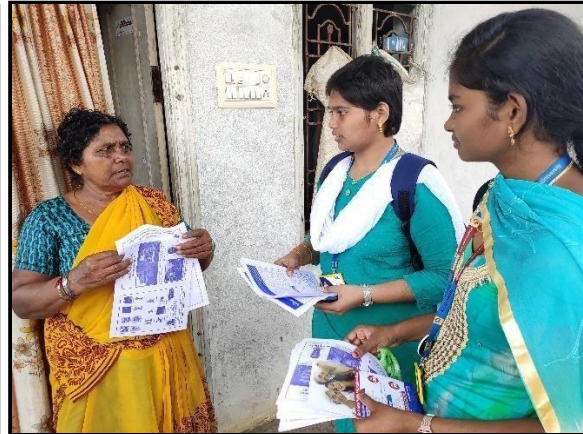
Awareness on Immunization Pham plates distribution to door to door at Pedapalem