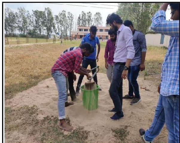
Volunteers Constriction of Class Rooms ZP High School at Pedapalem