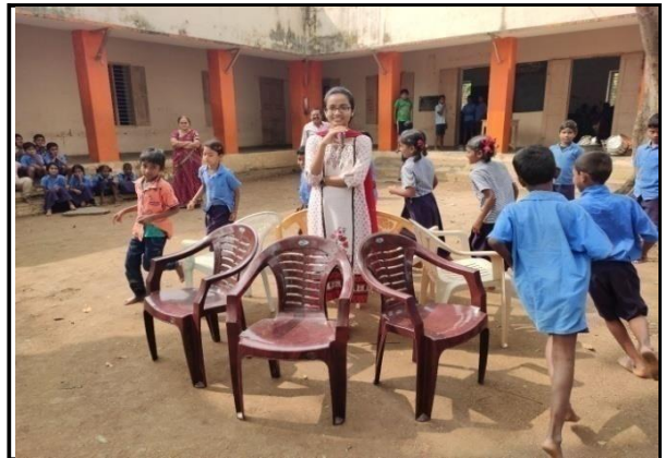
Sports Competitions conducted to Govt. School Students at Pedapalem