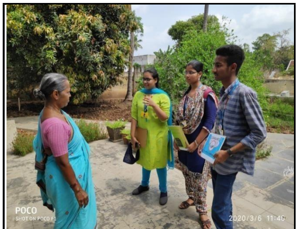
Awareness campaign on Health and Hygiene to door to door at Pedapalem village