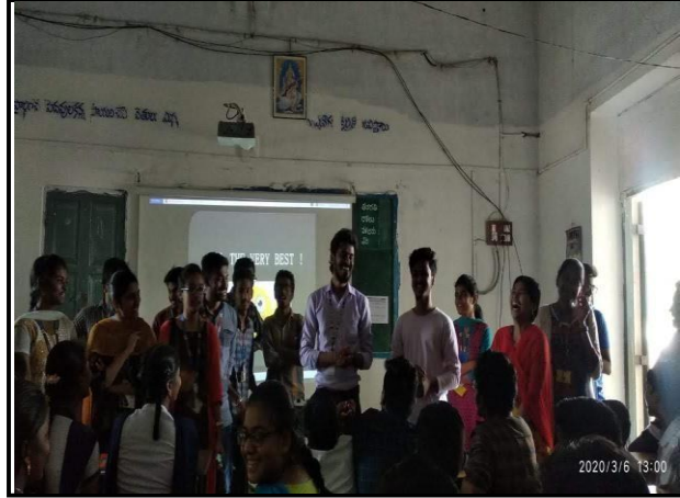
Awareness on Career Guidance to Govt. High School at Pedapalem