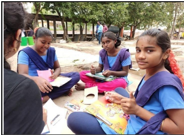
NSS Volunteers Training Hand Crafts to School Students