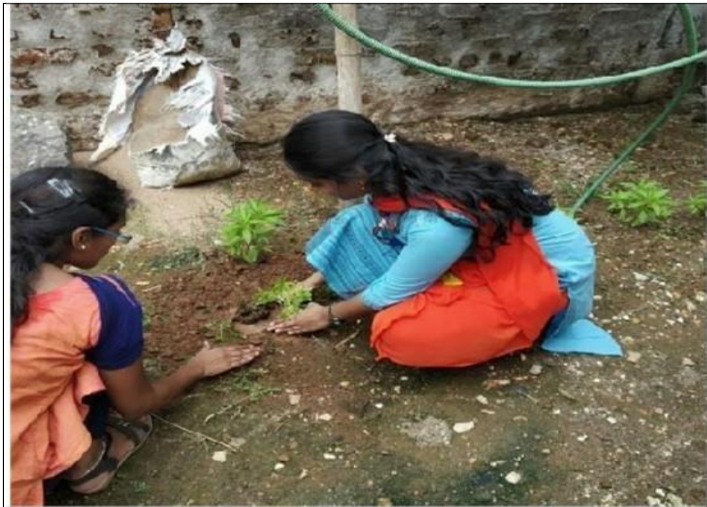
NSS Volunteers sapping of plants at Chirravuru