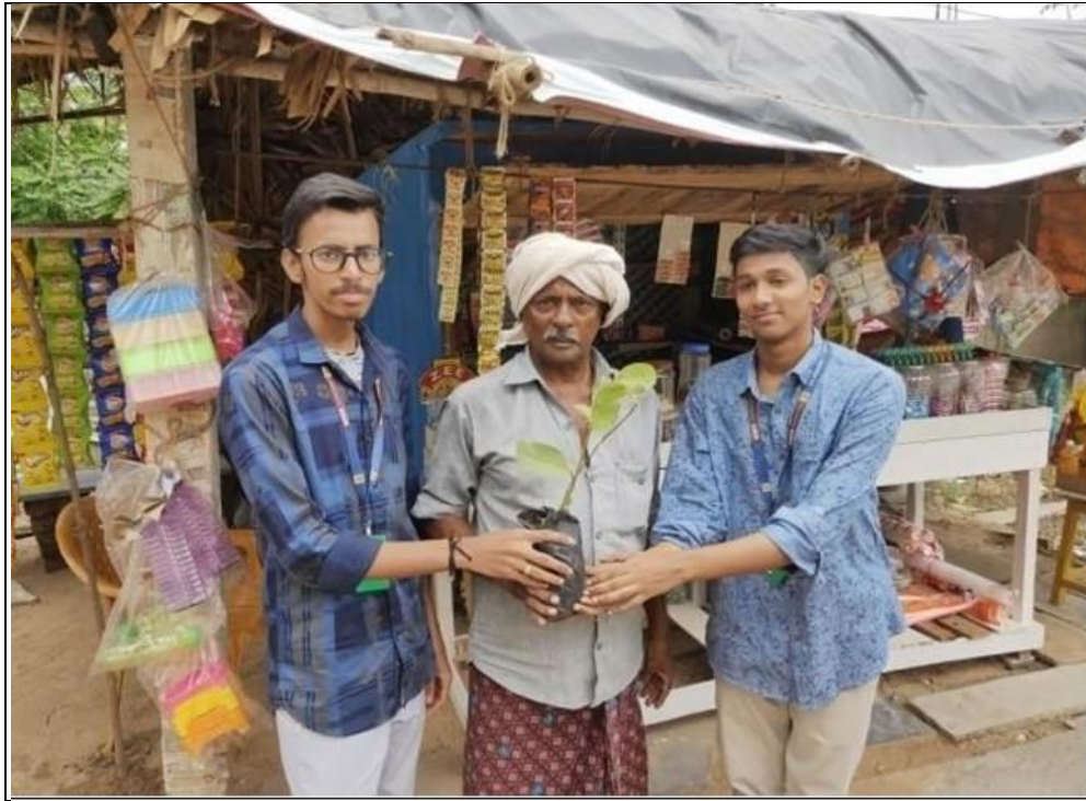
NSS Volunteers Plants distribution to Villagers at Chirravuru