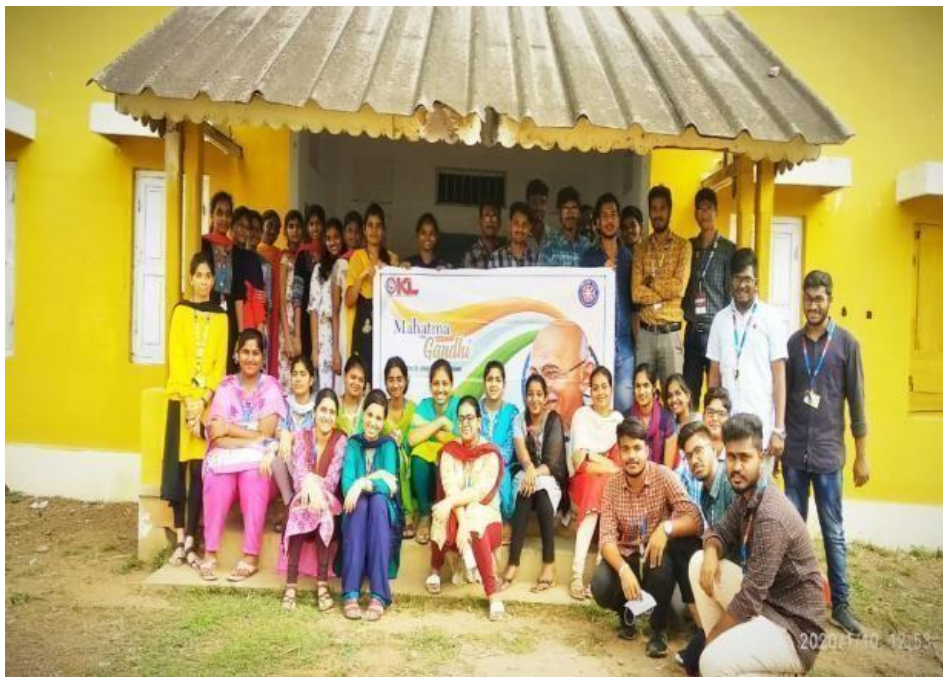
NSS Volunteers Clean the Primary Health Centre at Pedapalem on 10-01-2020

Date of Event :10-01-2020 Name of Event : Plastic removal &S wachh Bharath Venue : Pedapalem No. of Participants : Students:93Staff:02