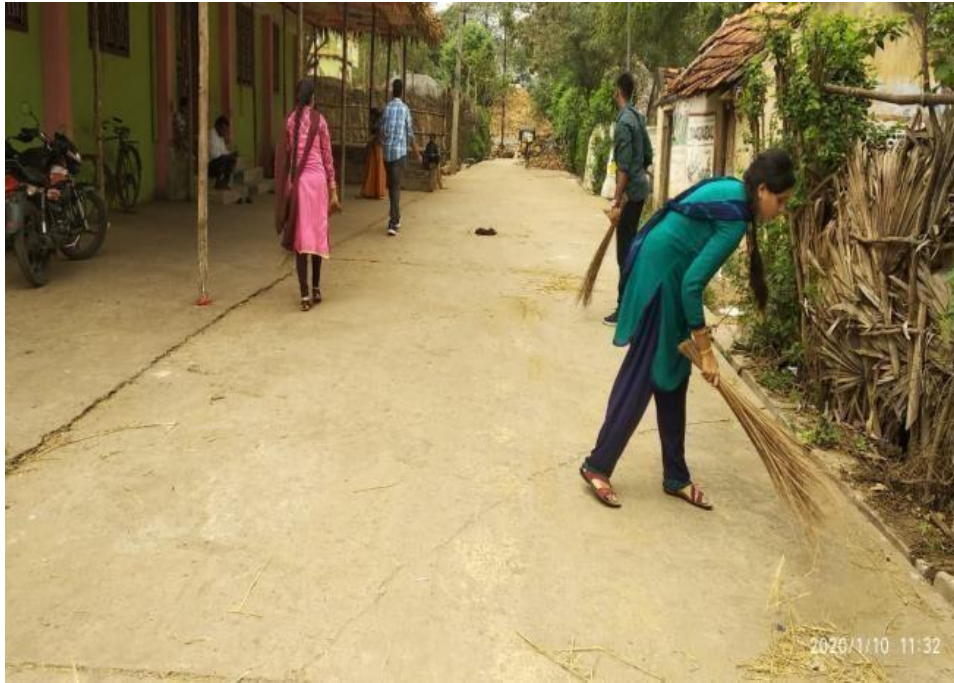
NSS Volunteers Clean the Roads at Pedapalem on 10-01-2020