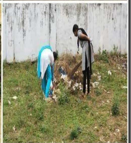
Volunteers Participating actively in swachh Bharath programs on 10-01-2020