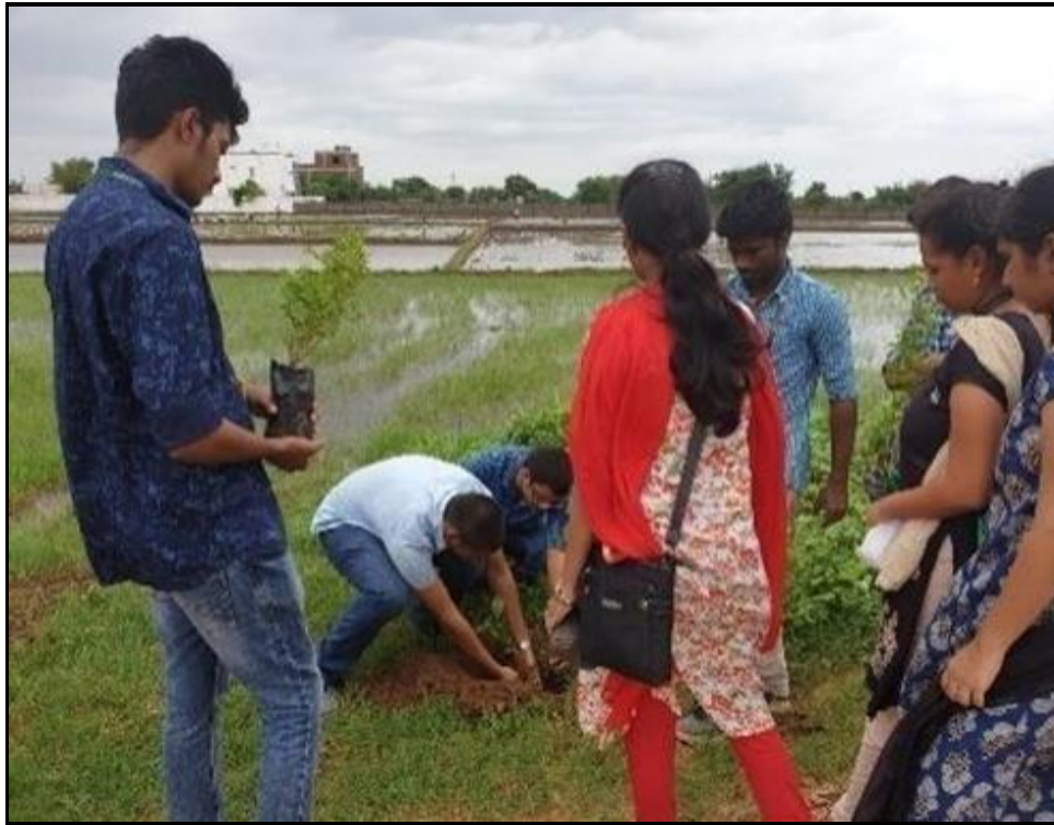
Plantation activity by volunteers at Prathuru village on 08-08-2019