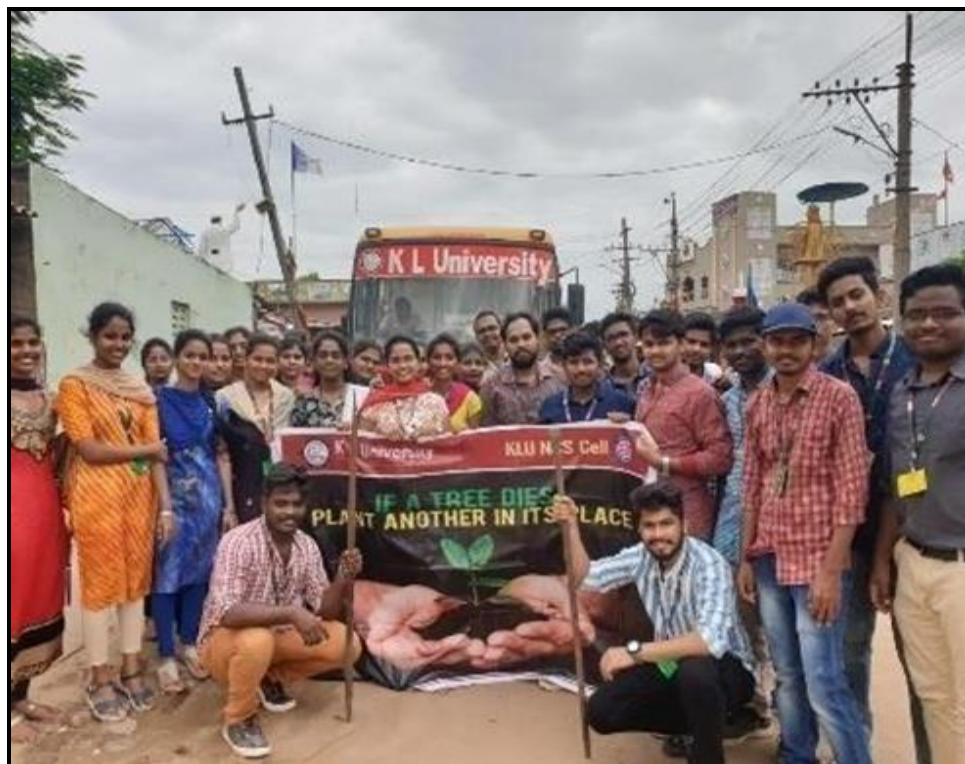
Group photo by NSS volunteers of UNIT-2 after the event at prathuru village on 08-08-2019