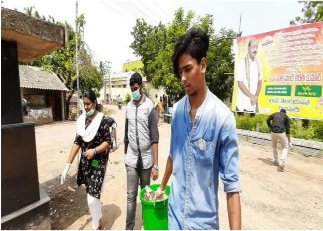
Not to use plastic and keep their premises clean and hygiene at chirravuru on 02-10-2019

In Recent Times plastic usage has been increasing abruptly, so we decided to create awareness on it. Plastic bags are cheap and light weight so people are interested in using these plastic bags rather than cloth bags which are costlier than plastic.