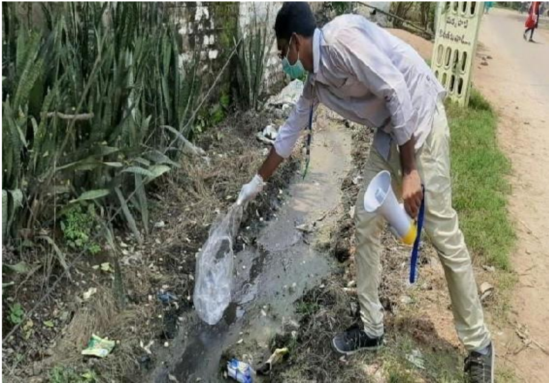
NSS Volunteers Removing Plastic Materials at Chirravuru

All the volunteers were divided into groups by the program officer with a faculty along with them and went in four directions of Chirravuru, to ensure that the volunteers covered most of the village premises.