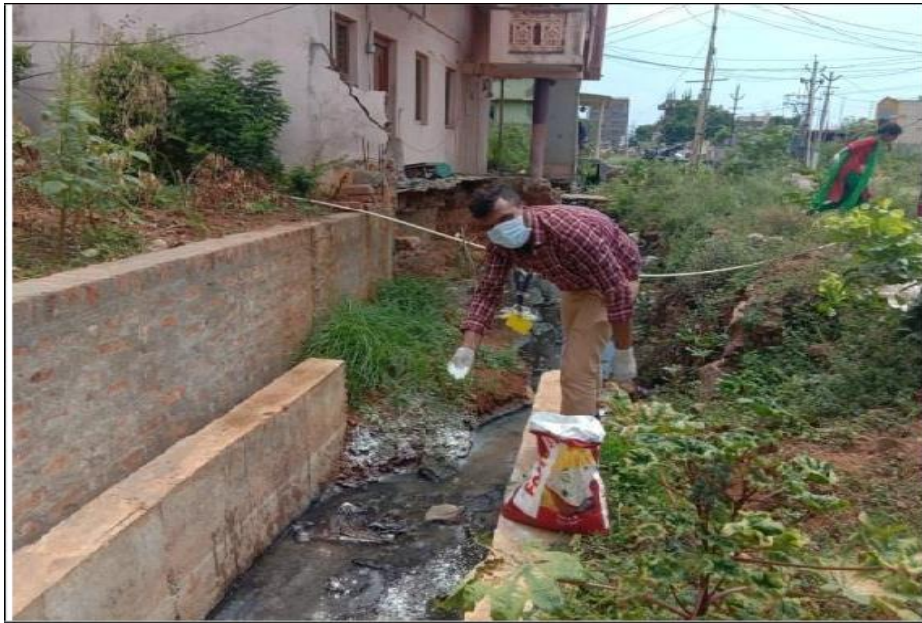
KLEF NSS Volunteers Spread the bleaching on drainages at Atmakuru on 14-09-2019