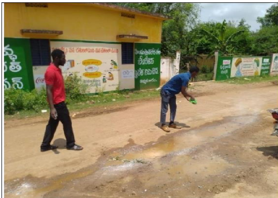
KLEF NSS Volunteers Spread the bleaching on roads at Atmakuru on 14-09-2019