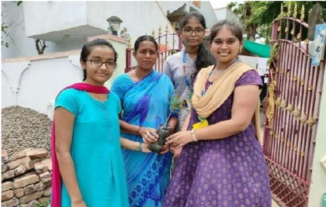
NSS Volunteers Distributing plants to villagers at Pedapalem on 30-08-2019.

Date of Event : 30-08-2019 Name of Event : Plantation Venue : Pedapalem. No. of Participants : Students: 92 Staff: 02