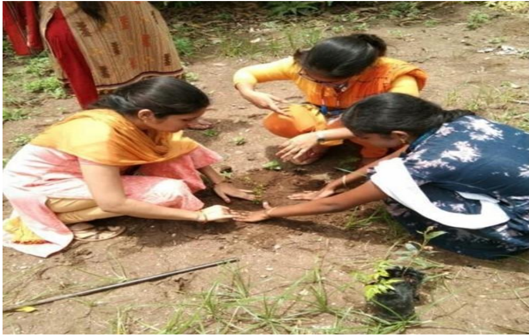
Volunteers gone through various streets and planted saplings by digging pits and watered them on 30-08-2019