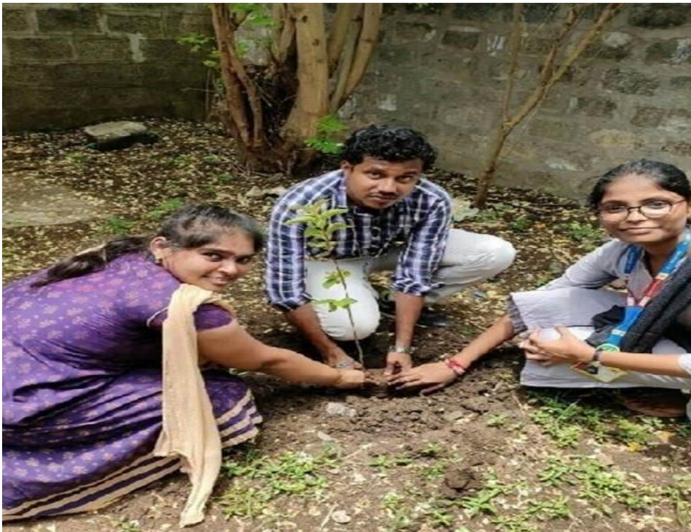
Students Planting Trees at Peddapalem village on 30-08-2019.

After reaching the village, volunteers met the panchayat members and identified the places to do Plantation activity. The panchayat members arranged all the equipment needed to plant. We have taken 80 saplings to plant.