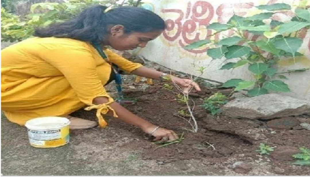
Students involving in plantation Activity at chirravuru village on 23-08-19