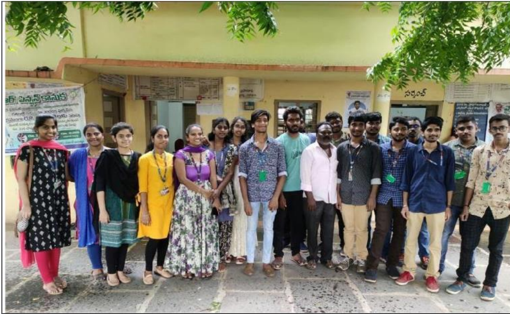
Group photo with panchayat staff at chirravuru village on 23-08-19.

"Trees exhale for us so that we can inhale them to stay alive. Can we ever forget that? Let us love trees with every breath we take until we perish."