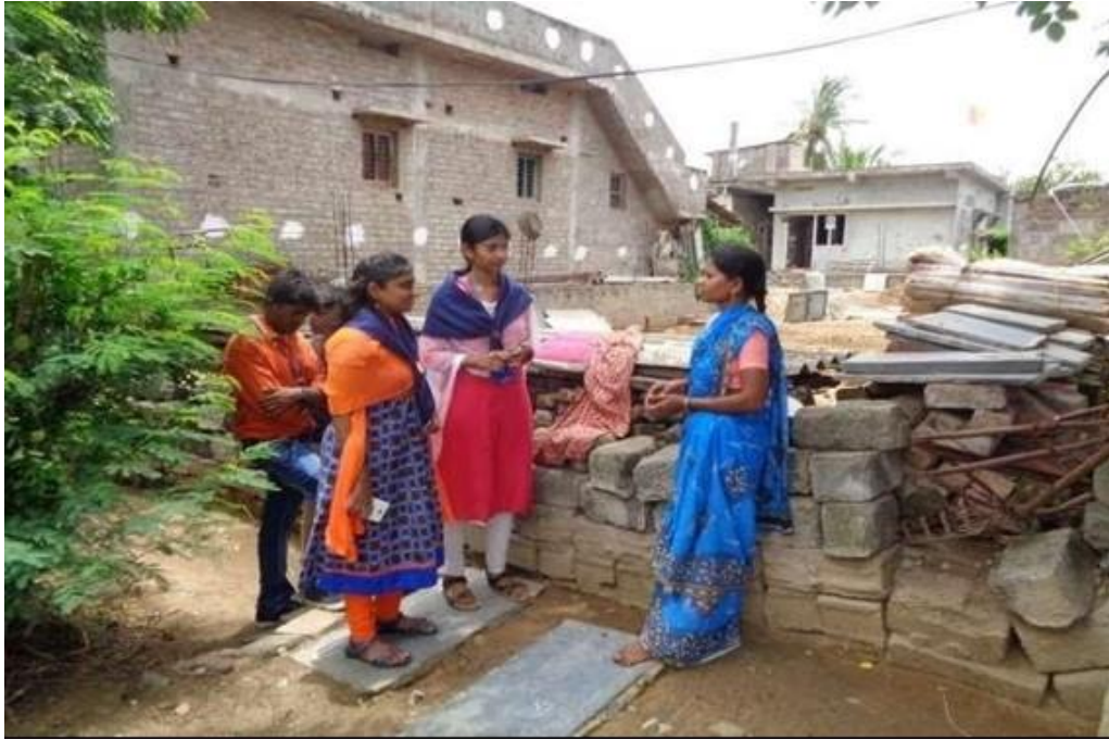
Volunteers Survey on Medical problems on 03-08-2018