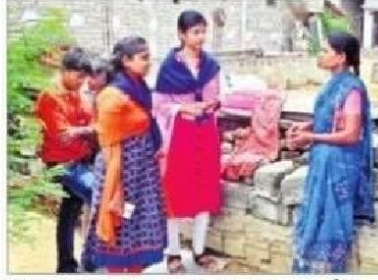
సర్వే నిర్వహిస్తున్న ఎన్ఎస్ఎస్ వాలంటీర్లు