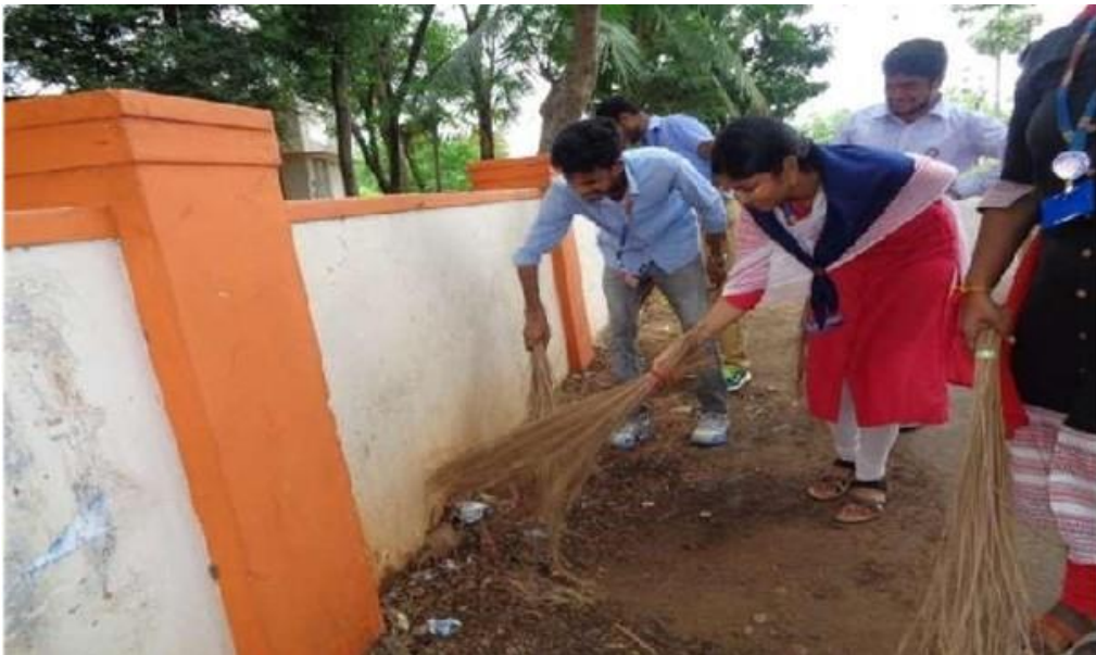
Volunteers involving in swachh Bharat on 03-08-2018