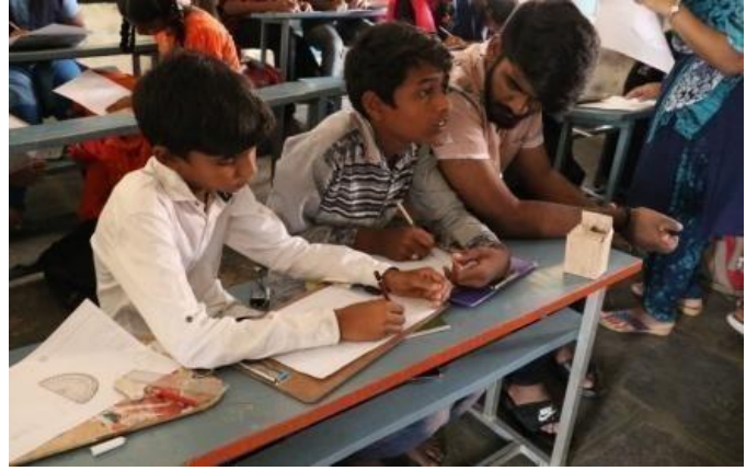
School building wall resuming work, Conducting of Drawing Competition on 10-03-2019