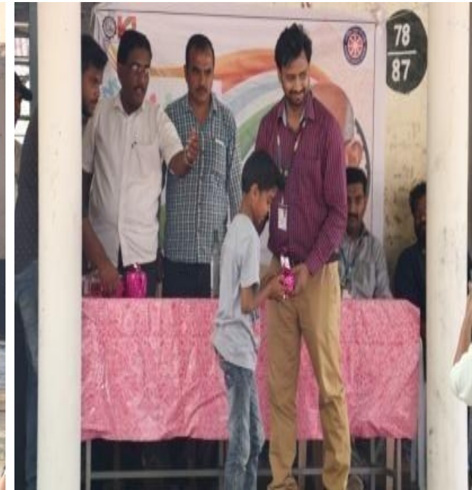
Speech for Faculty sharing Experience Prizes distribution on 11-03-2019