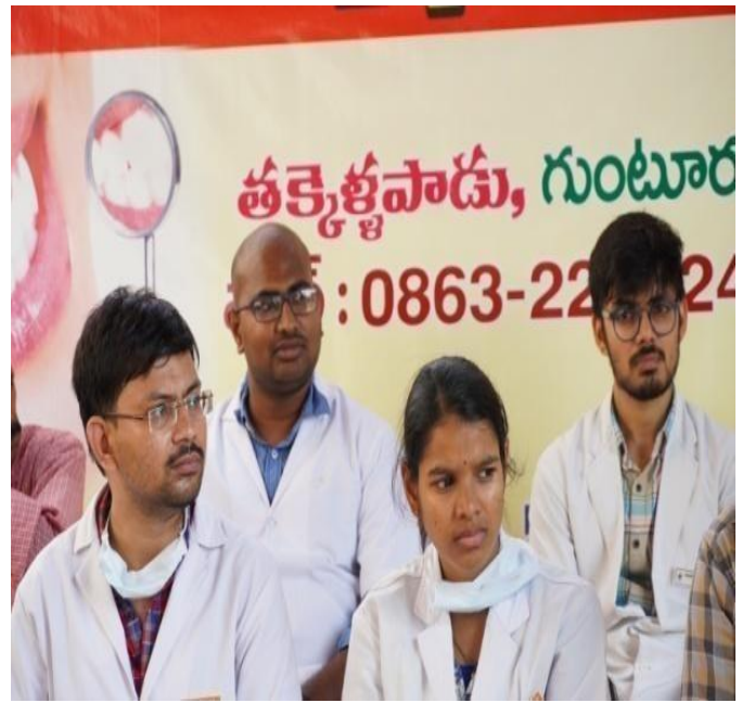
Dental Medical Camp – Sibar Dental College and Hospital 6 Doctors on 07-03-2019