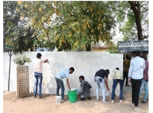
School building wall Cleaning and wall painting 09-03-2019