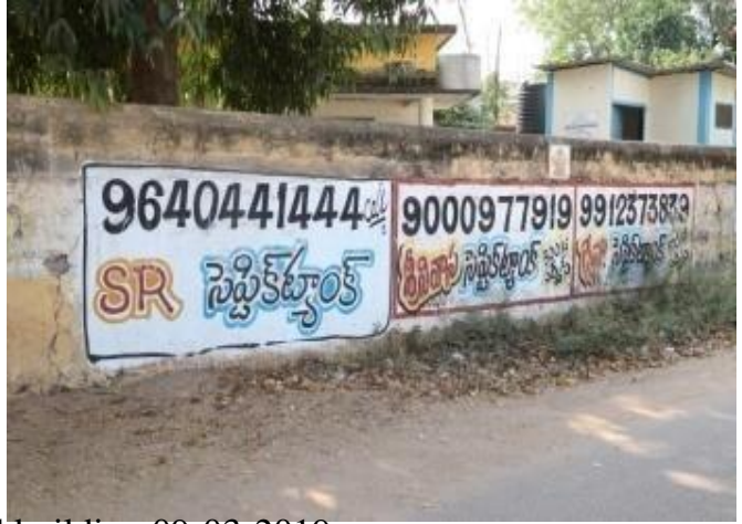
Before - school building 09-03-2019