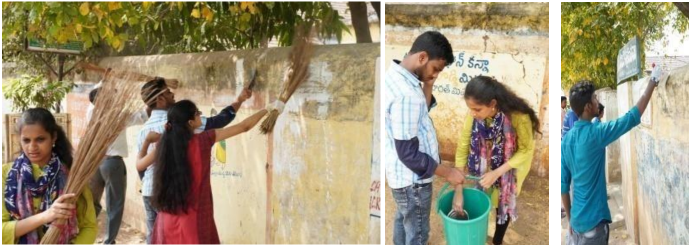
School building wall Cleaning and Posters Removing on 08-03-2019