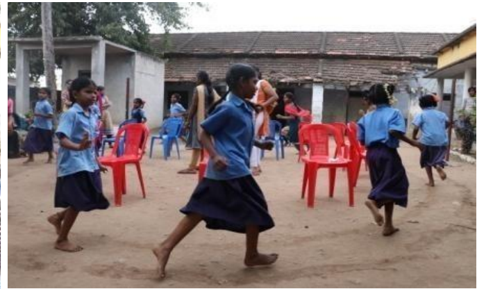
Conducting of musical chair Competition on 11-03-2019