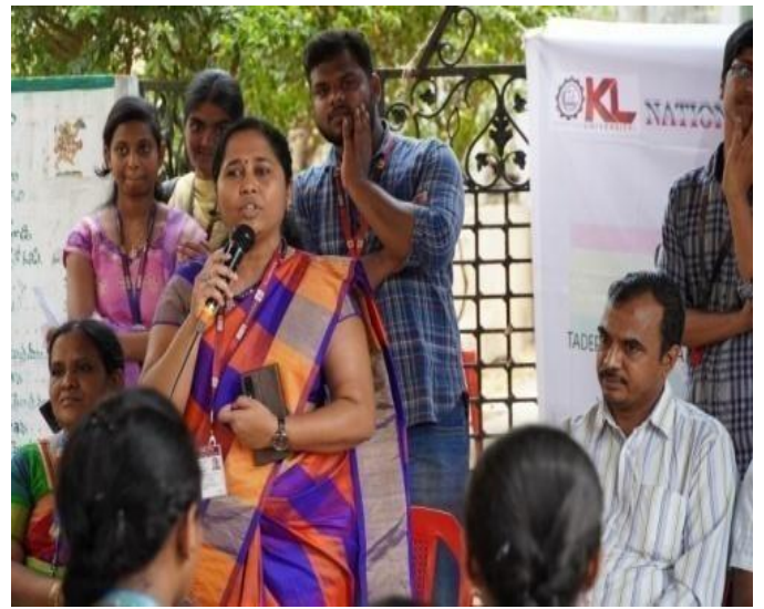
Inauguration ceremony by HOD of Dept. of Fine Arts on 05-03-2019