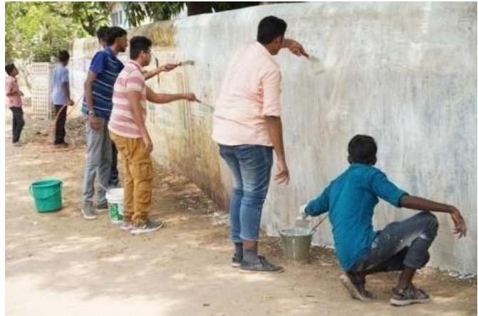
After School building wall painting 09-03-2019