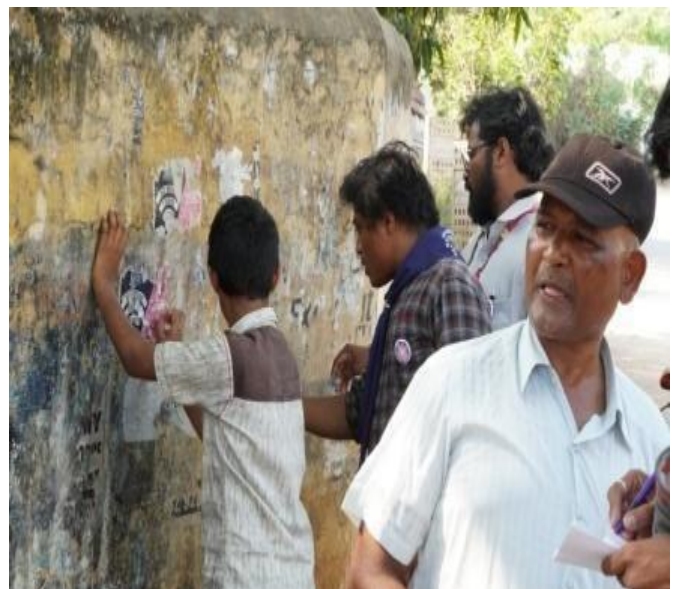
School Building surrounding Clean & Green and Posters Removing on 07-03-2019