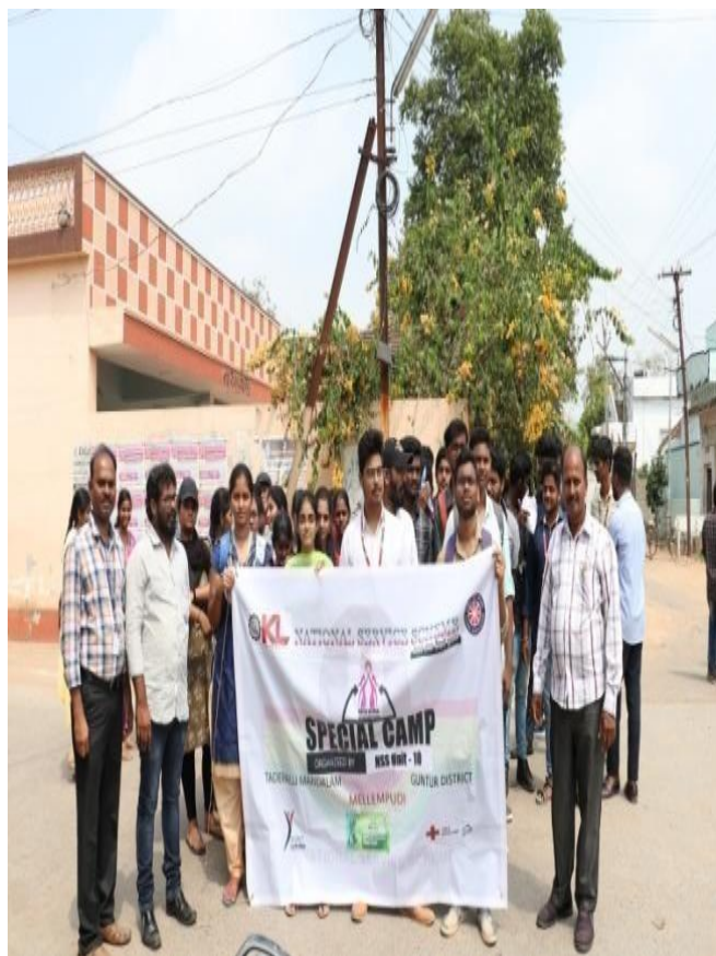
Volunteers conducted Swachh Bhart Rally on Mellampudi on 06-03-2019