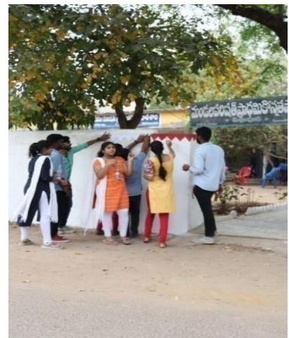
School building wall Cleaning and wall painting on 09-03-2019

https://www.facebook.com/klunss/videos/339717229997452/