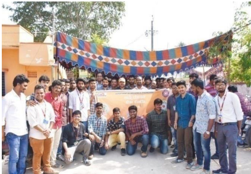
KLU NSS Team Group photo on eve of Janma Bhoomi Maa Vooru on 09-01-2019