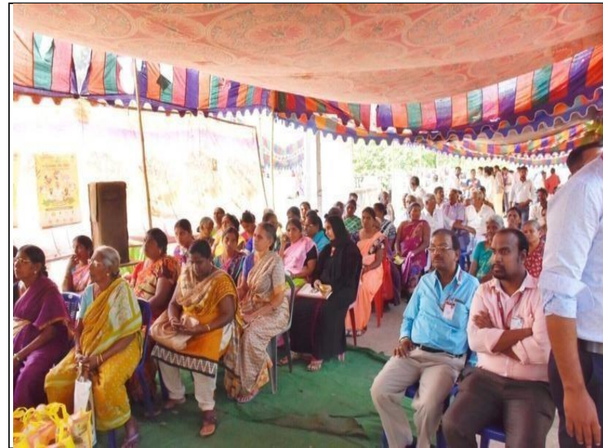
They are all engaged in various activities as part of the Janma Bhoomi Maa Vooru initiative on 09-01-2019