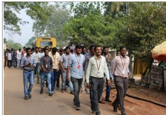
KLU faculty and NSS Volunteers are visiting houses and creating awareness on seasonal diseases on 26-12-2018