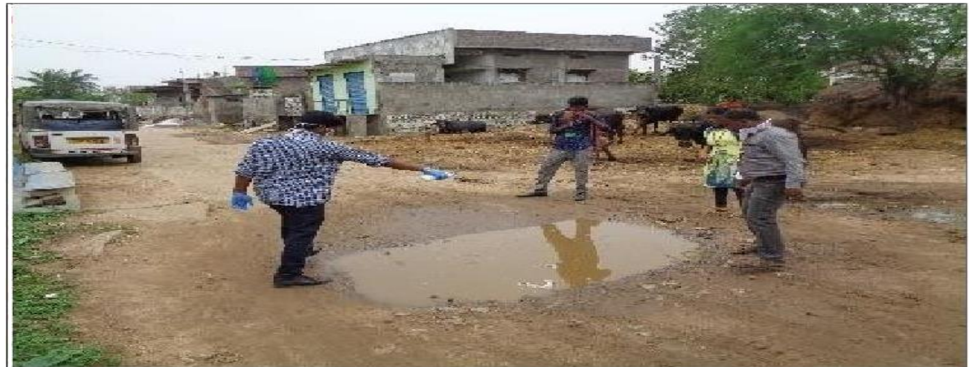
NSS Volunteers bleach and oil balls spread inside the drains for mosquitos Repelling on 20-09-2018