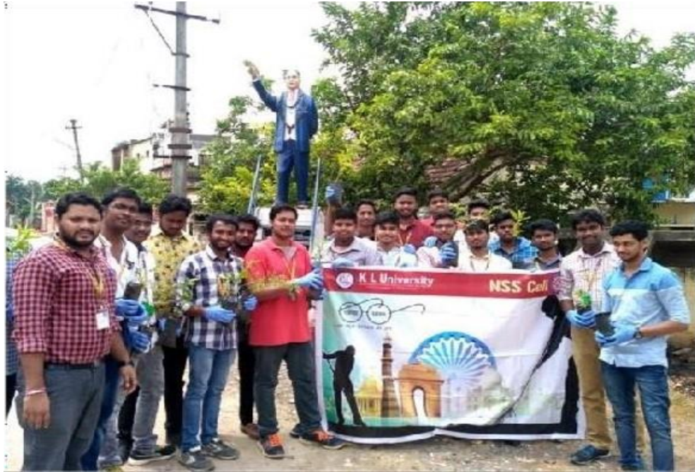
NSS Volunteers team Group photo on eve of plants distribution drive on 19-09-2018.