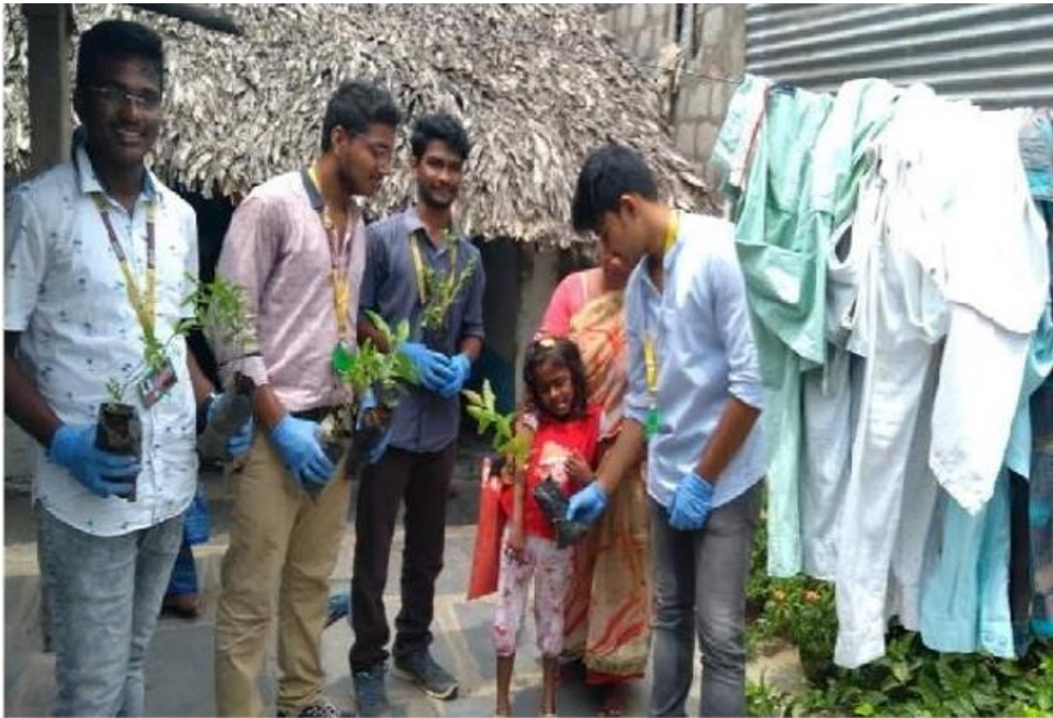
NSS Volunteers Distributed the plants to Villagers on 19-09-2018.