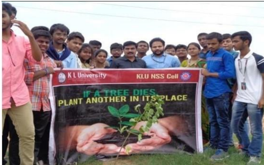
KLEF ECE NSS Team Group Photo on eve of Plantation on 23-08-2018