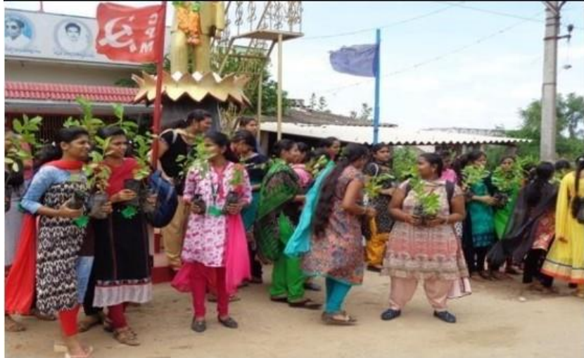
KL University Students Distributing the Plants to villagers on 23-08-2018