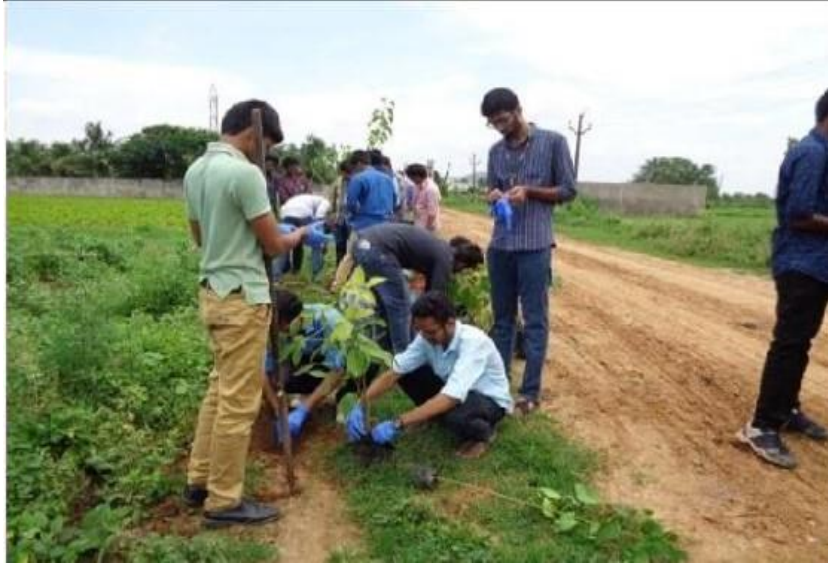
NSS Volunteers Sapling of plants at Prathuru on 23-08-2018