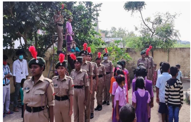
demo drill awareness to school Students on 07-12-2021