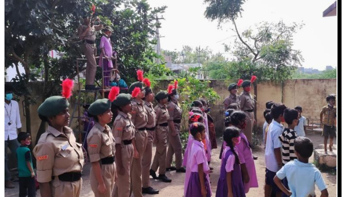
self defence awareness to school Students on 07-12-2021