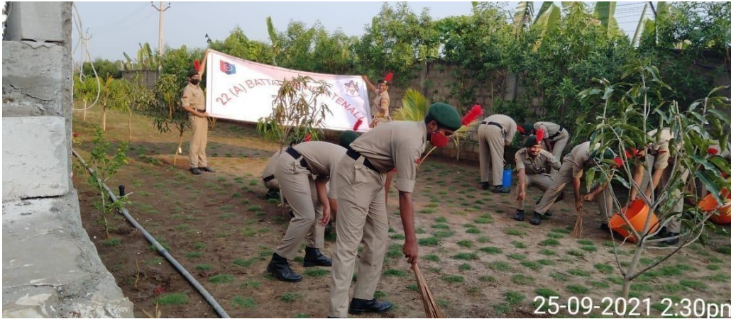
NCC Cadets are cleaning the ground and removing the wastage from the ground

Later, PM Modi took his request forward during his weekly program, Mann KiBaat and appealed each and every citizen to be a part of plastic-free India movement. Many celebrities and leaders have joined PM Modi and have taken his plastic-free India appeal forward.